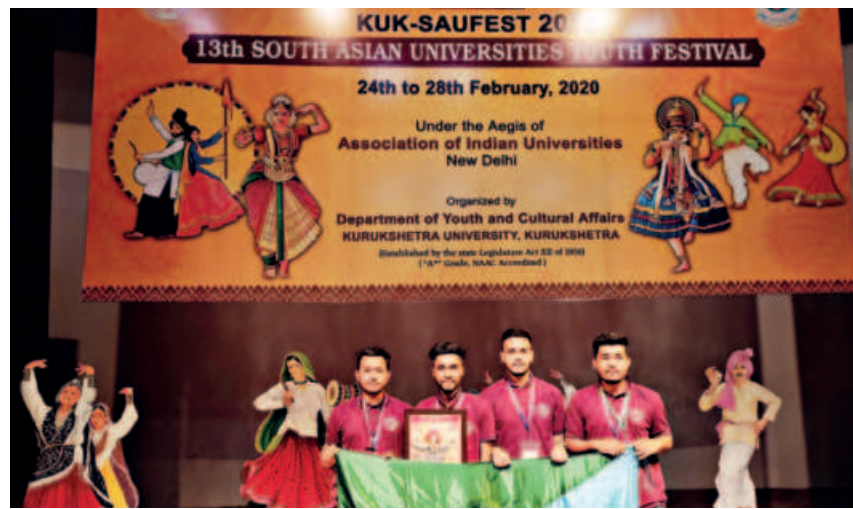
Southeast Cultural Society (SCS) of Southeast University at the South Asian University Fest