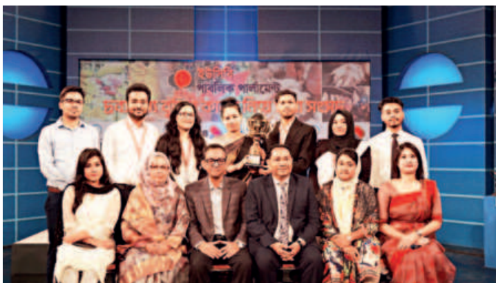
▲ State University Bangladesh Debate team won the "UCB Parliamentary Debate"

One of the notable clubs, The Robotics Club of BRAC University (ROBU), encourages its members to gain skills