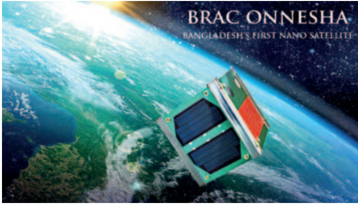
▲ BRAC Onnesha, the first nano-satellite created by a Bangladeshi university