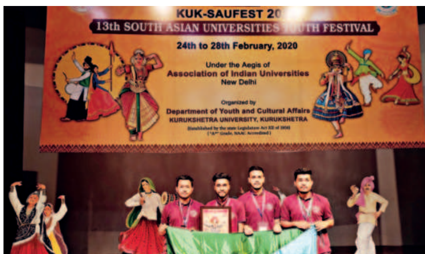
Southeast Cultural Society (SCS) of Southeast University at the South Asian University Fest