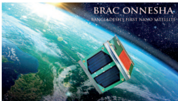
▲ BRAC Onnesha, the first nano-satellite created by a Bangladeshi university