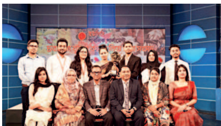
▲ State University Bangladesh Debate team won the "UCB Parliamentary Debate"

One of the notable clubs, The Robotics Club of BRAC University (ROBU), encourages its members to gain skills