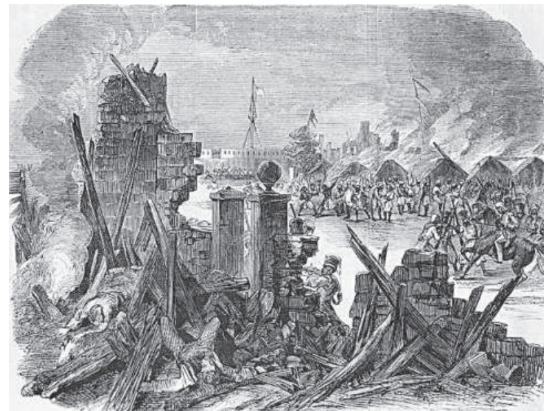
"The Sepoy revolt at Meerut", wood-engraving from the Illustrated London News, 1857.