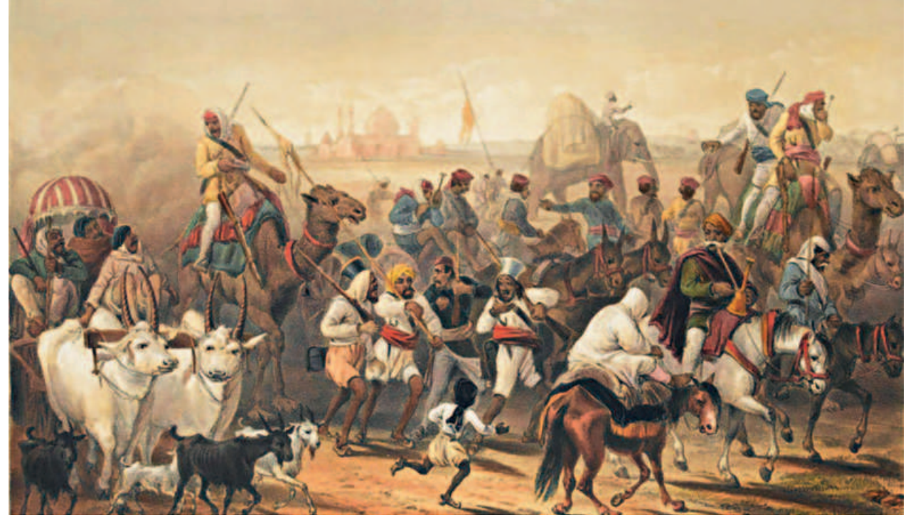
Troops of the Native Allies. Painting by George Francklin Atkinson, 1859.