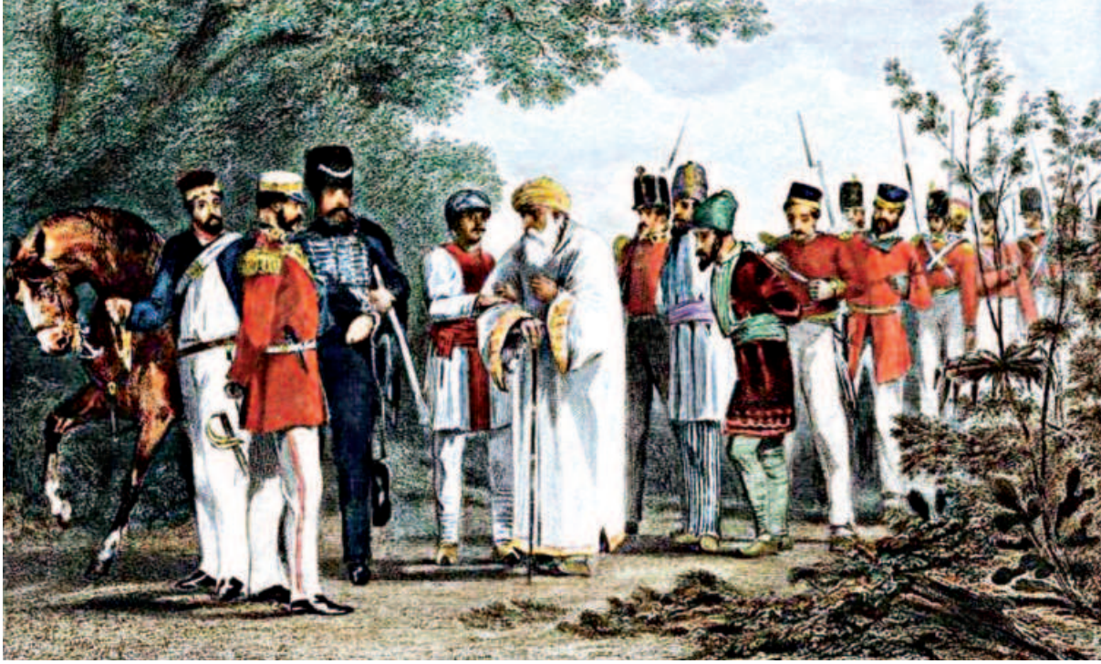
Capture of Bahadur Shah Zafar and his sons by William Hodson at Humayun's tomb on 20 September 1857.