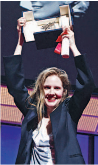
Justine Triet receives the Palme d’or for “Anatomy of a Fall”.

On Saturday night, cinema’s marquee event, the 76th iteration of the Cannes Film Festival finally came to a close. While the festival might initially have been a place for artists to assemble and recognise each other’s efforts, the modern-day version is a pop-culture event that captivates the masses as well. Like a sea of stars, celebrities flooded the red carpet with their glamorous outfits, once again becoming the main focus point for Cannes worldwide. Like each year, people argued back and forth over whether Cannes is a film or fashion festival, taking further focus away from the films being screened. Looking back, the major movies being screened at the festival were Indiana Jones and the Dial of the Destiny ; Martin Scorsese’s Killers of the Flower Moon ; Johnny Depp starrer Jeanne du Barry ; Wes Anderson’s Asteroid City ; and Justine Triet’s Anatomy of a Fall , just to name a few. Bangladesh had its own film, Aronyo Anawer’s Maa , starring Pori Moni, screening at the Marche Du Film. We even had our own stall at the festival, for the first time ever. However, the stall—which is expected to be a gateway into a country’s film and culture—remained empty for the most part. This mishap occurred over a reported logistical issue, where BFDC members were