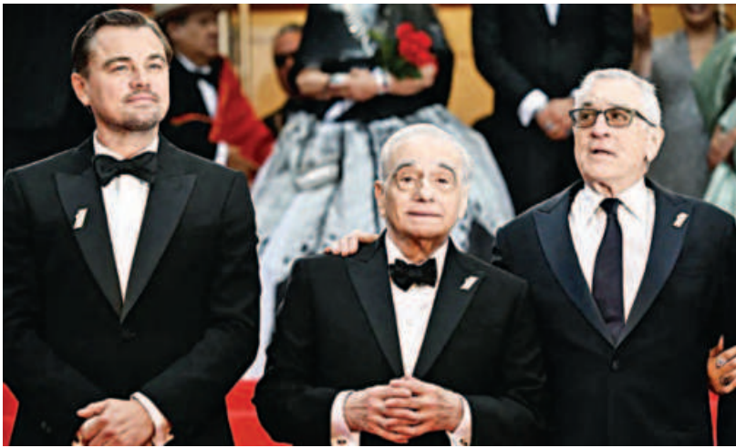
(L-R) Leonardo DiCaprio, Martin Scorsese and Robert De Niro at the premiere of “Killers of The Flower Moon”.