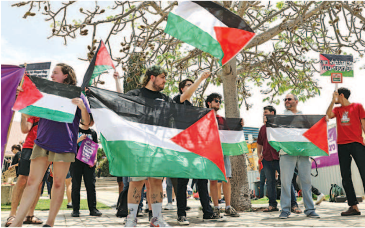
Arab-Israeli students and Israeli left-wing activists lift flags and placards during a protest against a new law bill bolstering restrictions on raising the Palestinian flag, at the Tel Aviv University campus in the eponymous coastal city yesterday.