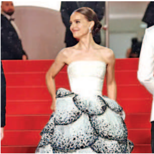
Natalie Portman attends the premiere of “May December”.