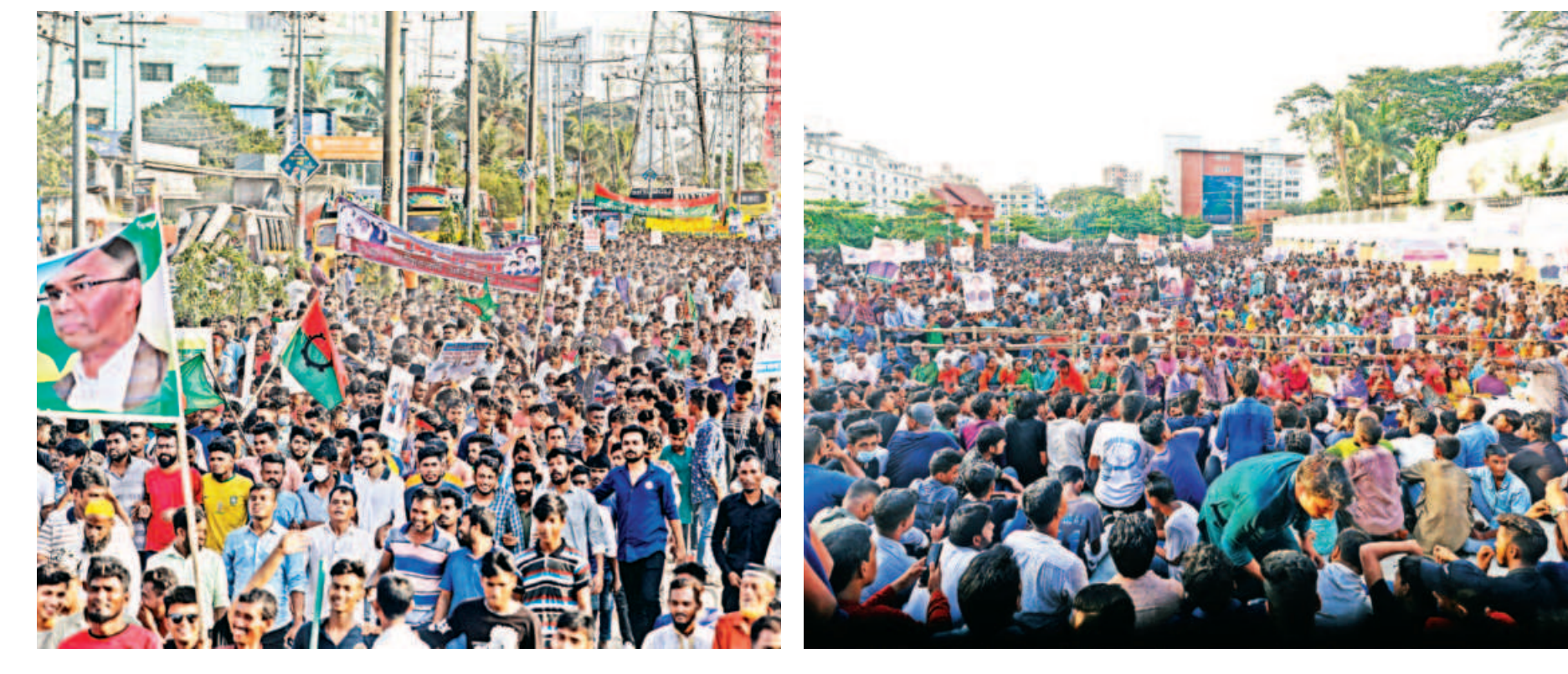
Chattogram turned into a city of procession and rally yesterday as the ruling party and BNP held programmes in Laldighi Maidan and Bakalia area respectively. In Bakalia, BNP brought out a procession demanding resignation of the Awami League government, left. Meanwhile, AL held a peace rally at the Laldighi Maidan to protest against the arson attacks and violence by BNP-Jamaat men.