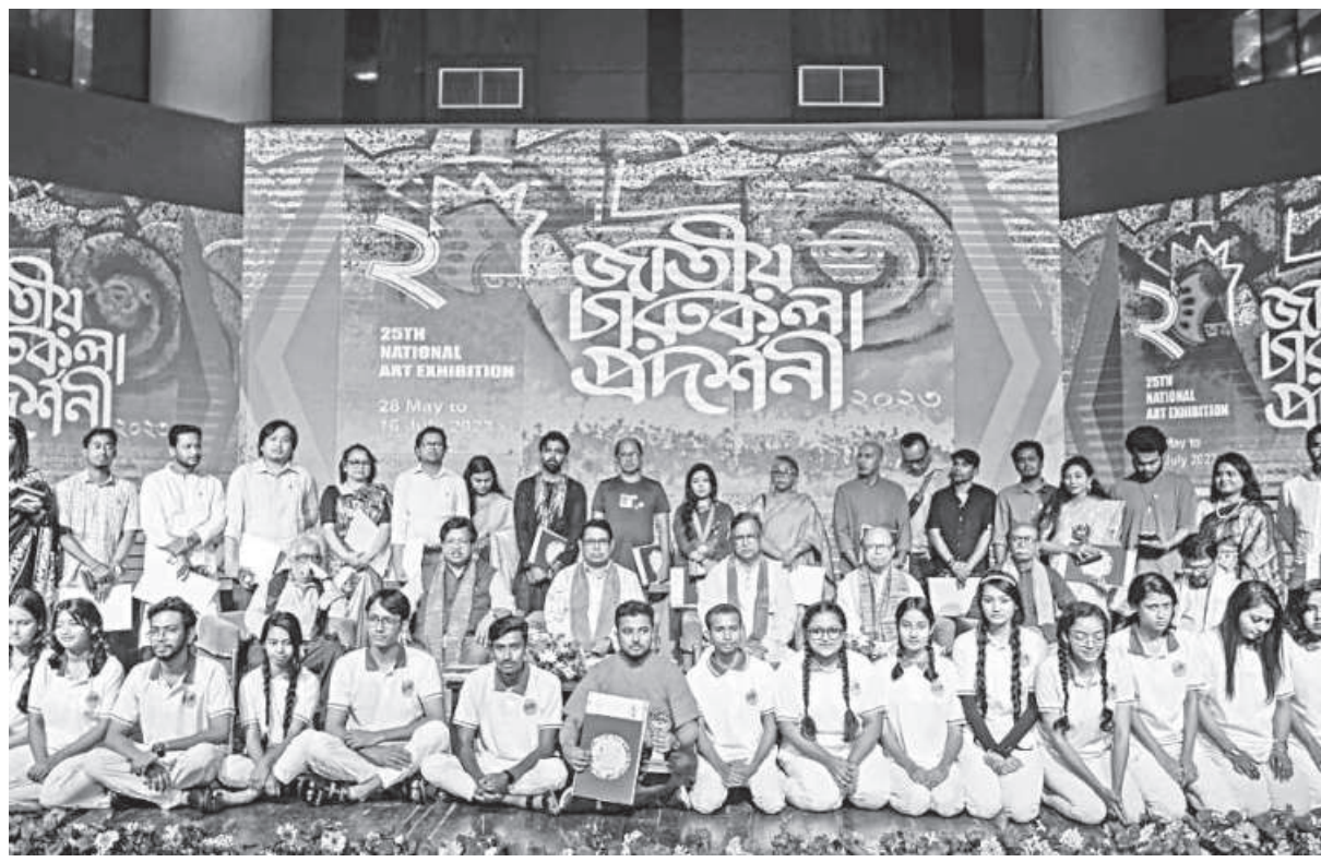
The 25th National Art Exhibition commenced yesterday at Shilpakala Academy, which will feature 301 projects of 261 artists in 11 mediums. The event will run till July 16 from 11:00am to 8:00pm.