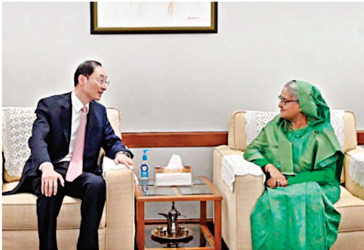
Vice Minister of the Foreign Ministry of China Sun Weidong calls on Prime Minister Sheikh Hasina at the Gono Bhaban yesterday.