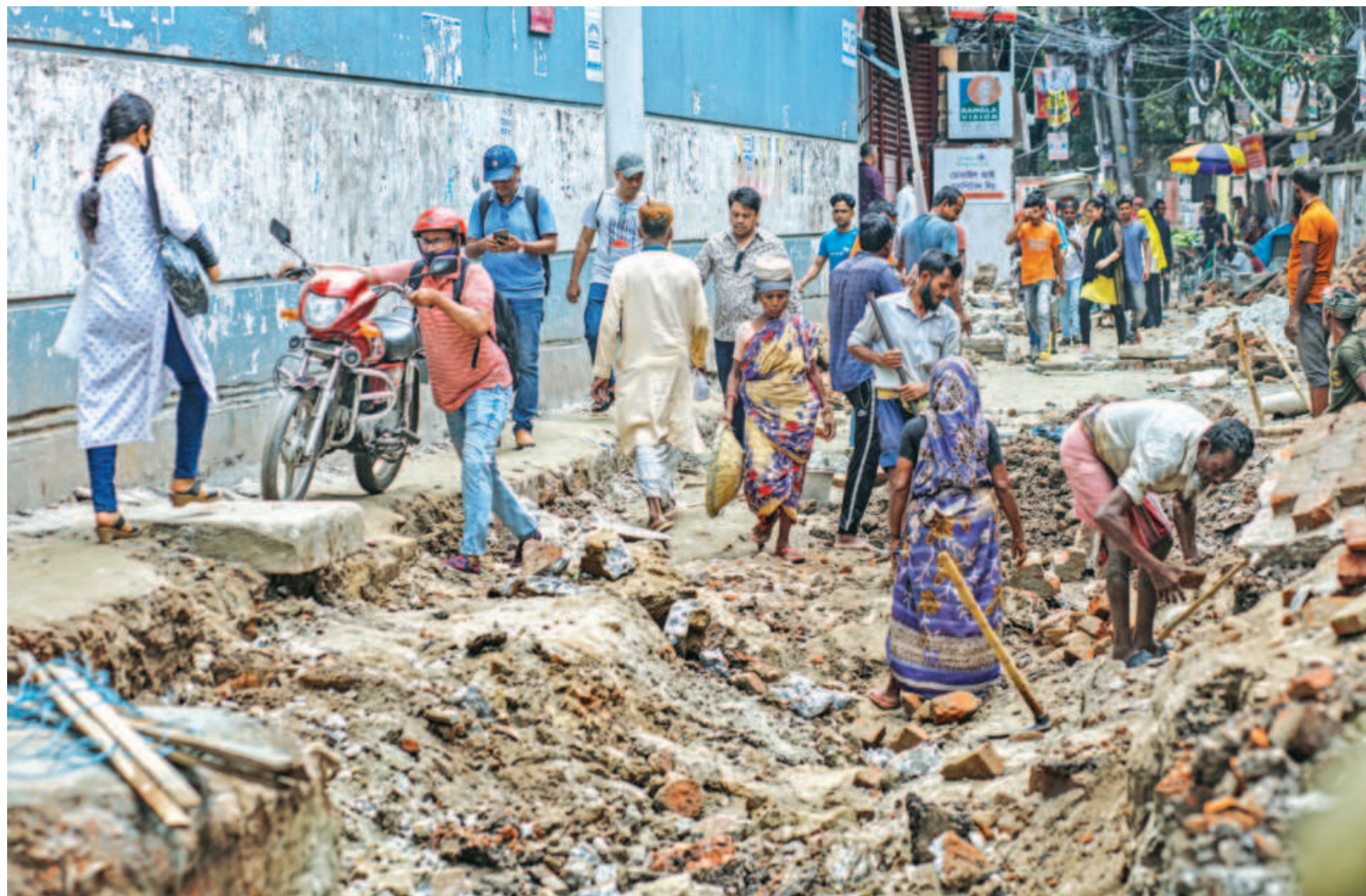
For the last three months, locals have been finding it difficult to use the East Rajabazar road due to an ongoing drainage work. With no safety nets in place or adequate space to walk, people continue to take on risk while crossing the road. This photo was taken yesterday.