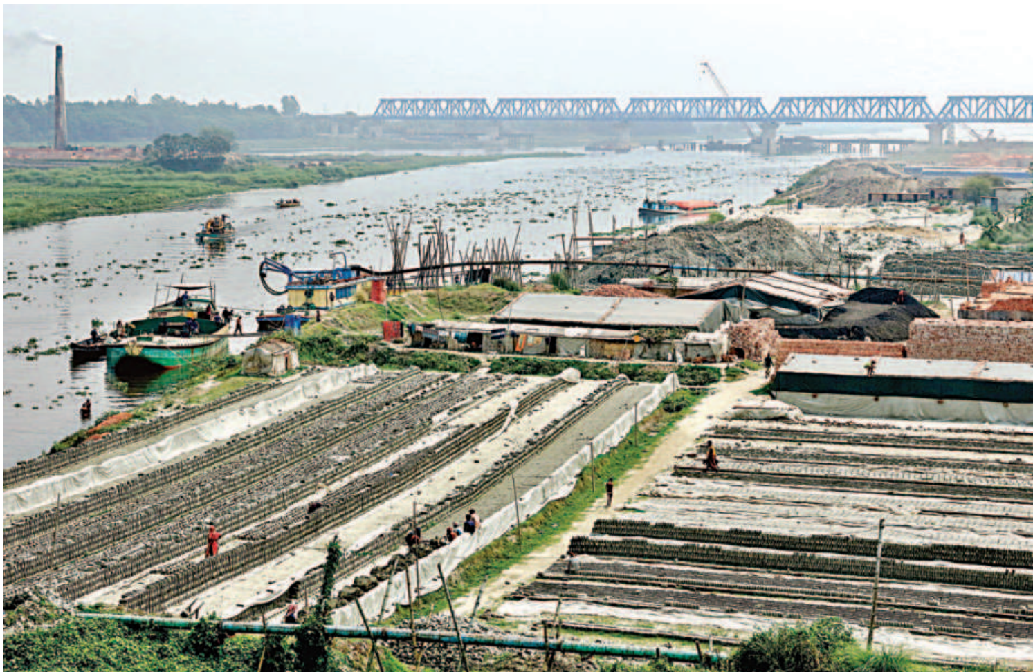
The Dhaleshwari river has been significantly narrowed, and the reclaimed land is being used to make bricks. As is often the case, the brick kiln owners have disregarded the ecological importance of the river and bypassed legal restrictions. The photo was taken in Sirajdikhan upazila of Munshiganj recently.