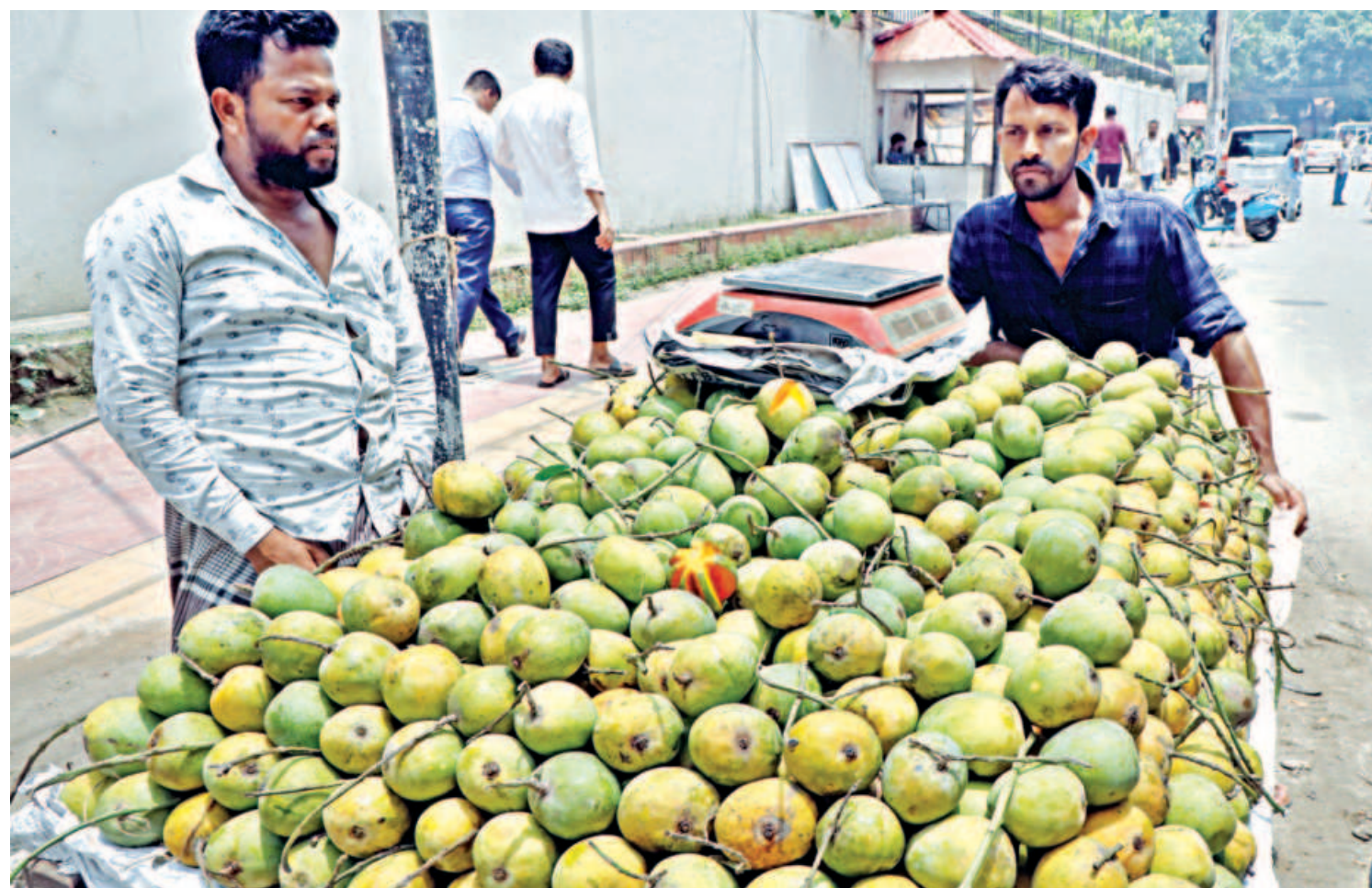
A trader is seen selling mango near the Jatiya Press Club in Dhaka yesterday. Those who enjoy the refreshing summer fruit are overjoyed with the current prices, which go as low as Tk 50 per kilogramme depending on the variety.