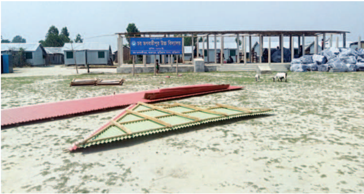
Erosion by the Brahmaputra river is about to devour the entire compound of Char Bhagabatipur High School located in Kurigram Sadar upazila.

The previous schoolhouse was on the verge of collapse as high tide continued to hit the institution directly due to emerging chars on the upstream of the Brahmaputra river, the UNO said.