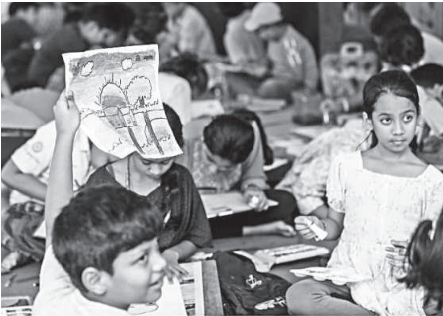
Children in the port city had a fun day yesterday. They took part in an art competition at Foy's Lake where they were able to express themselves through colours. Around 700 children aged between five and 12 from 25 schools participated in the event.