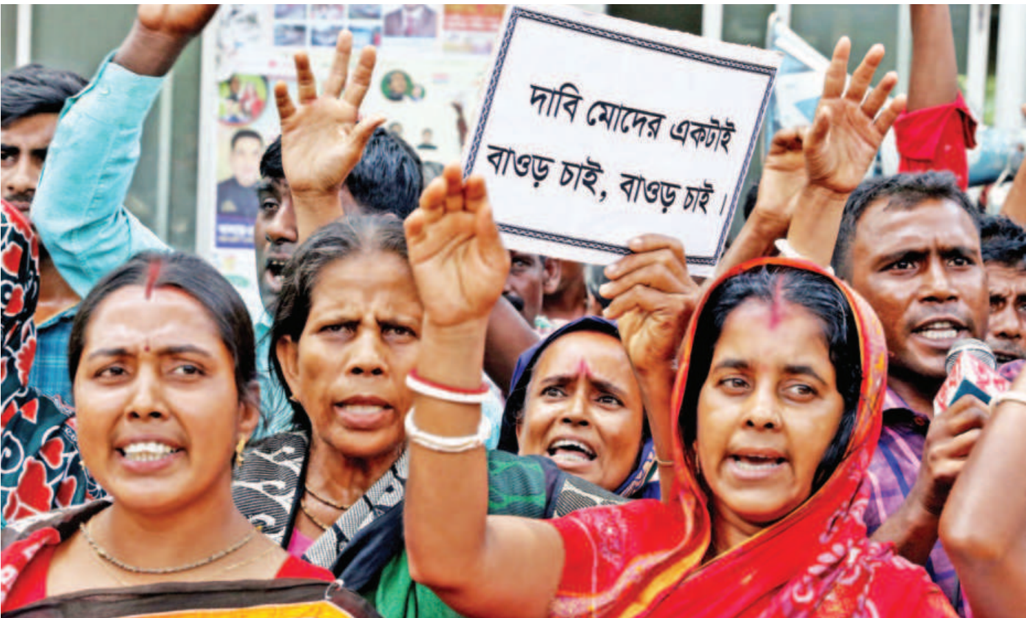
Opposing the decision to lease out six baors (waterbodies) to a hatchery, a group of people, whose livelihoods solely depend on fishing in the waterbodies, staged a demonstration in front of Jatiya Press Club yesterday. They said at least 40,000 fisher families will be affected by this fish farming in Kotchandpur of Jhenidah. They also urged the government to take steps to preserve local fish. The six baors include Baluahr, Jayadia, Marjad, Bergobindapur, Kathgara and Khoter Pal.