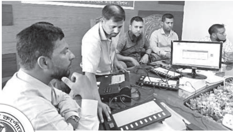
As part of a three-day workshop on "EVM Troubleshooting", officials are being given training at the Regional Election Office in Barishal yesterday.

Judicial and executive magistrates will be present in all centres, in addition to law enforcers