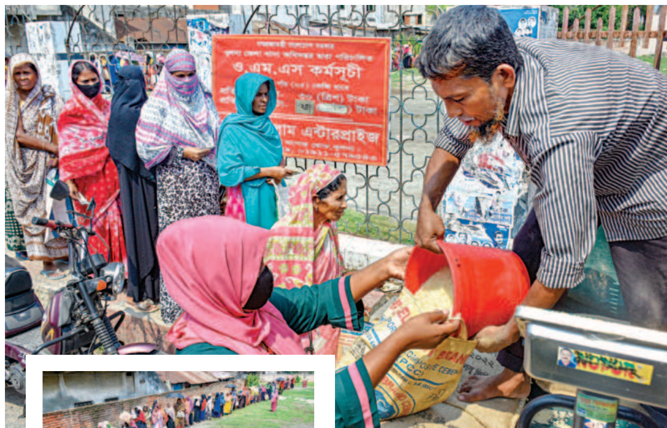
A woman buys rice from an OMS truck in Khulna city's Sheikh Para yesterday. Inset, women line up under the scorching sun to buy the staple at subsidised price. They had to wait for about three hours before being able to buy a maximum of five kg rice at Tk 30 per kg.