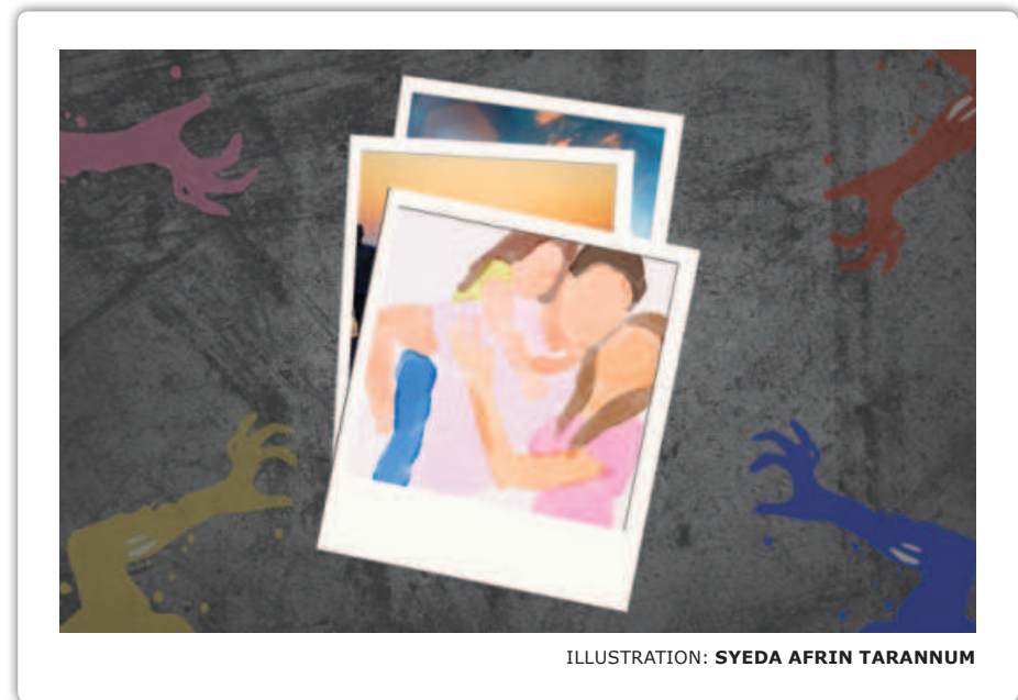
ILLUSTRATION: SYEDA AFRIN TARANNUM

Raian likes asking questions. Ask him a question in return at abedinraian@gmail.com