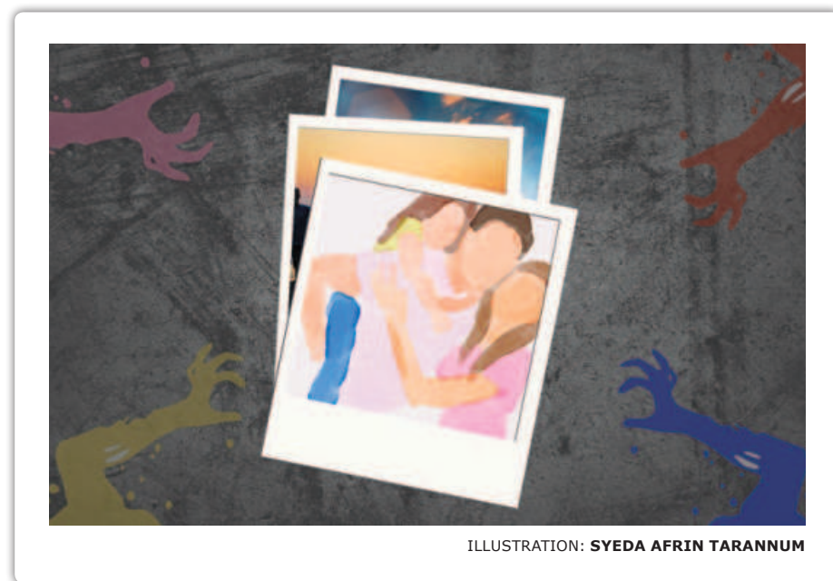
ILLUSTRATION: SYEDA AFRIN TARANNUM

Raian likes asking questions. Ask him a question in return at abedinraian@gmail.com