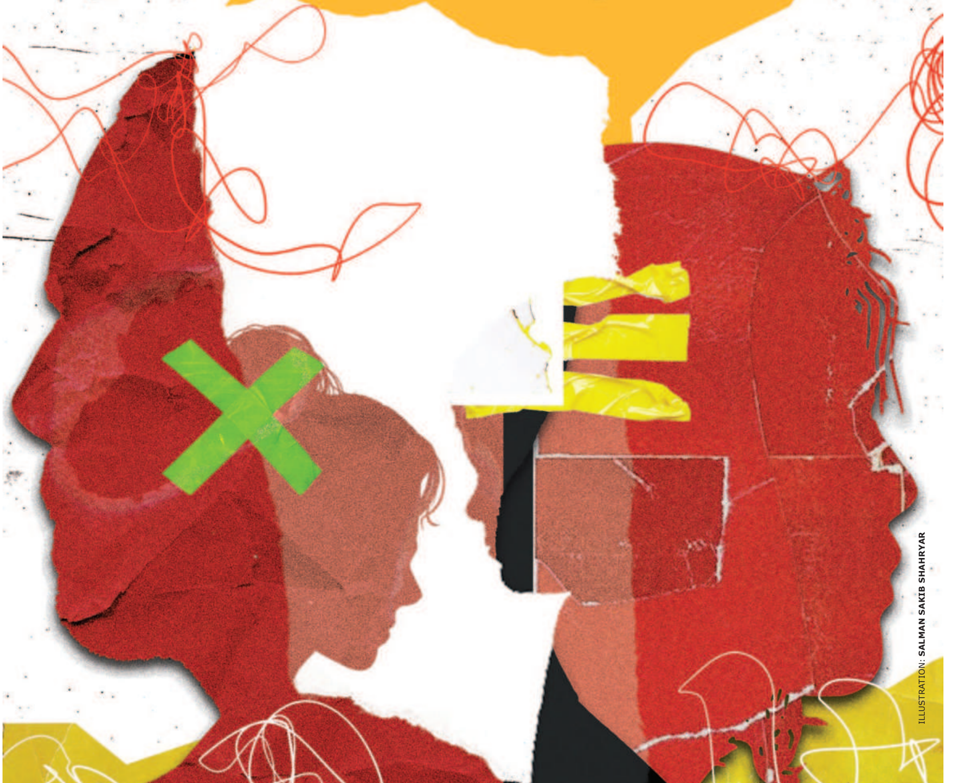
ILLUSTRATION: SALMAN SAKIB SHAHRYAR