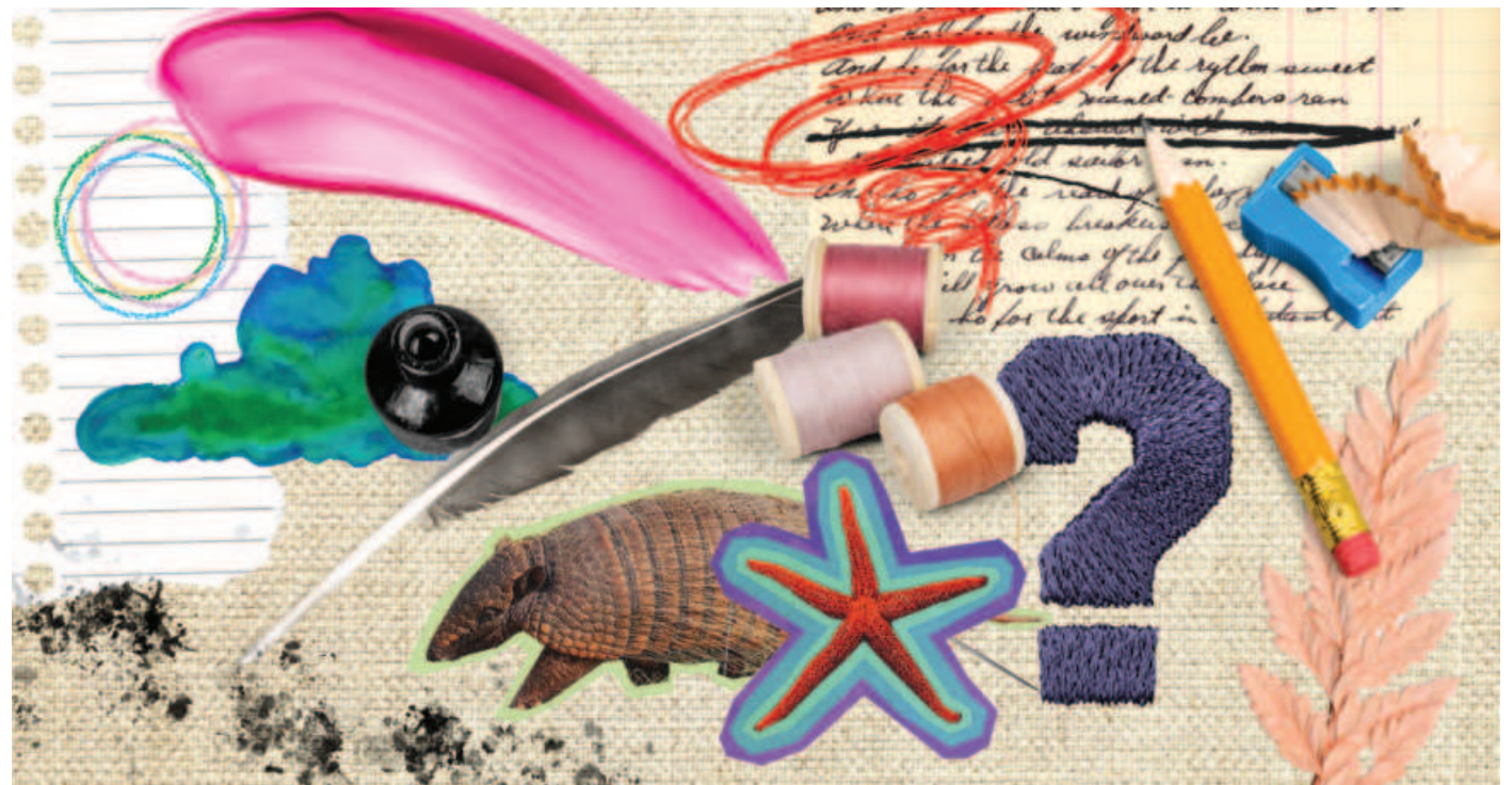
ILLUSTRATION: FATIMA JAHAN ENA

Again, the process or the journey might not be as smooth as we may have expected, as it's natural to face hurdles along the way. This can overwhelm many to the point where they would rather abandon a task than go forward. In this case, it may be worthwhile to take a step back to gain some perspective. If you are too overwhelmed, take a breather and try to get back to the