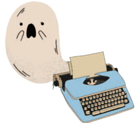
ILLUSTRATION: ABIR HOSSAIN