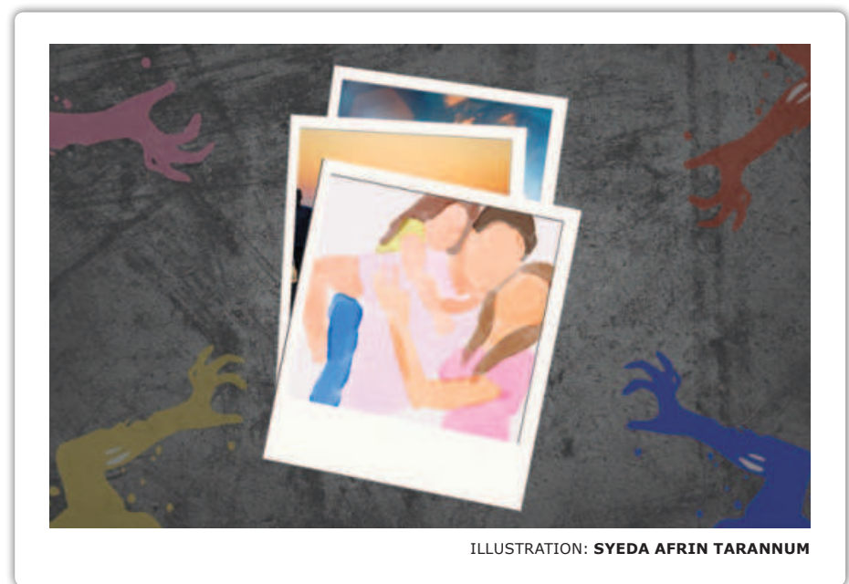
ILLUSTRATION: SYEDA AFRIN TARANNUM

Raian likes asking questions. Ask him a question in return at abedinraian@gmail.com