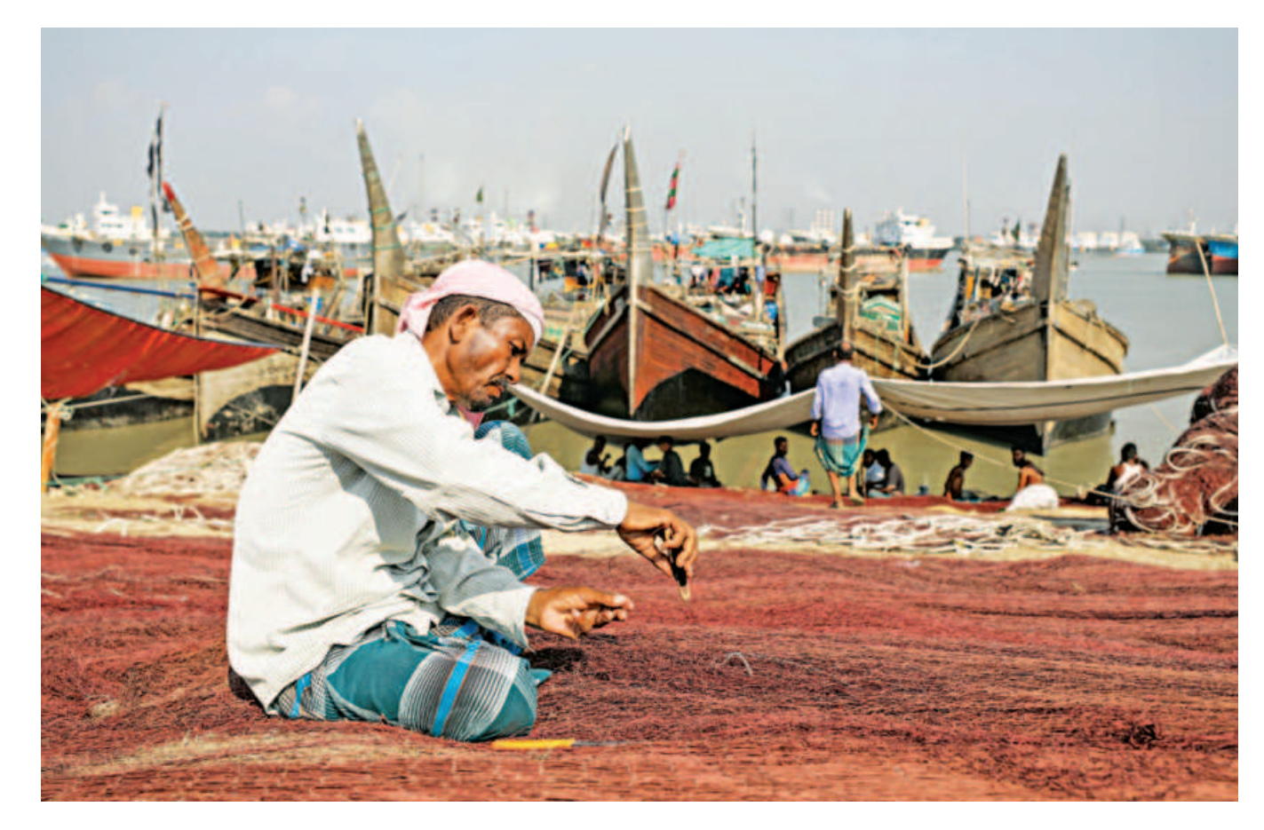
With a 65-day ban on fishing in the sea in force from May 20, a fisherman uses his time to mend a net on the Karnaphuli in Chattogram city's Baklia area on Tuesday. Fishing boats are seen moored. The government imposes such bans every year to ensure fish breeding.