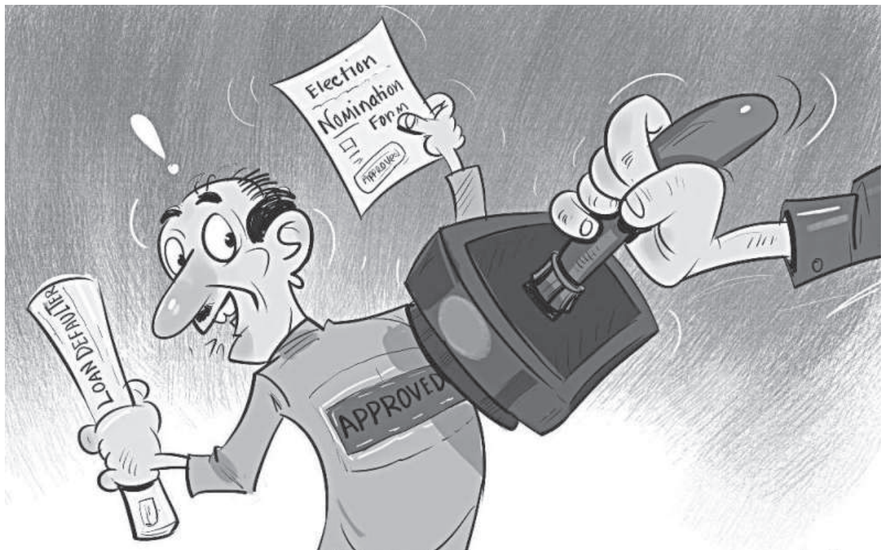
ILLUSTRATION: BIPLOB CHAKROBORTY

- in a number of elections since the abolition of the caretaker government system has eroded trust in the existing system of vote counting, tallying, and