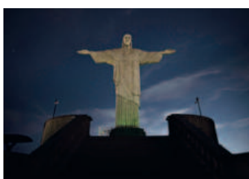
The lights on Rio de Janeiro's iconic statue of Christ the Redeemer were switched off for an display of solidarity with Vinicius Jr.

Video emerged Monday of Valencia fans chanting "Vinicius,