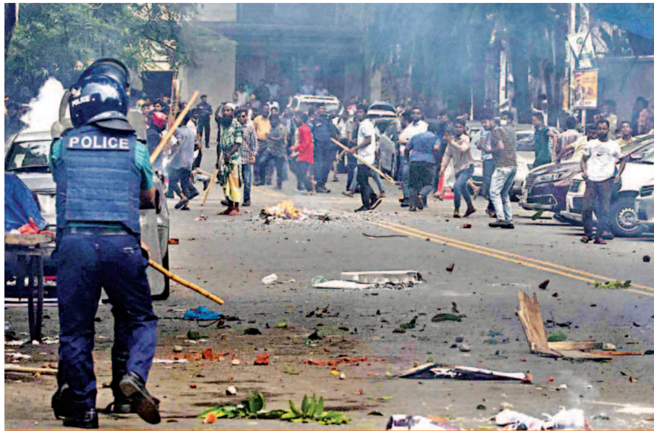
BNP activists clash with police in the capital's Science Laboratory area. The clash broke out after a road march of the party reached the area yesterday afternoon. The BNP staged the demonstration to press home its 10-point demand, including resignation of the government.