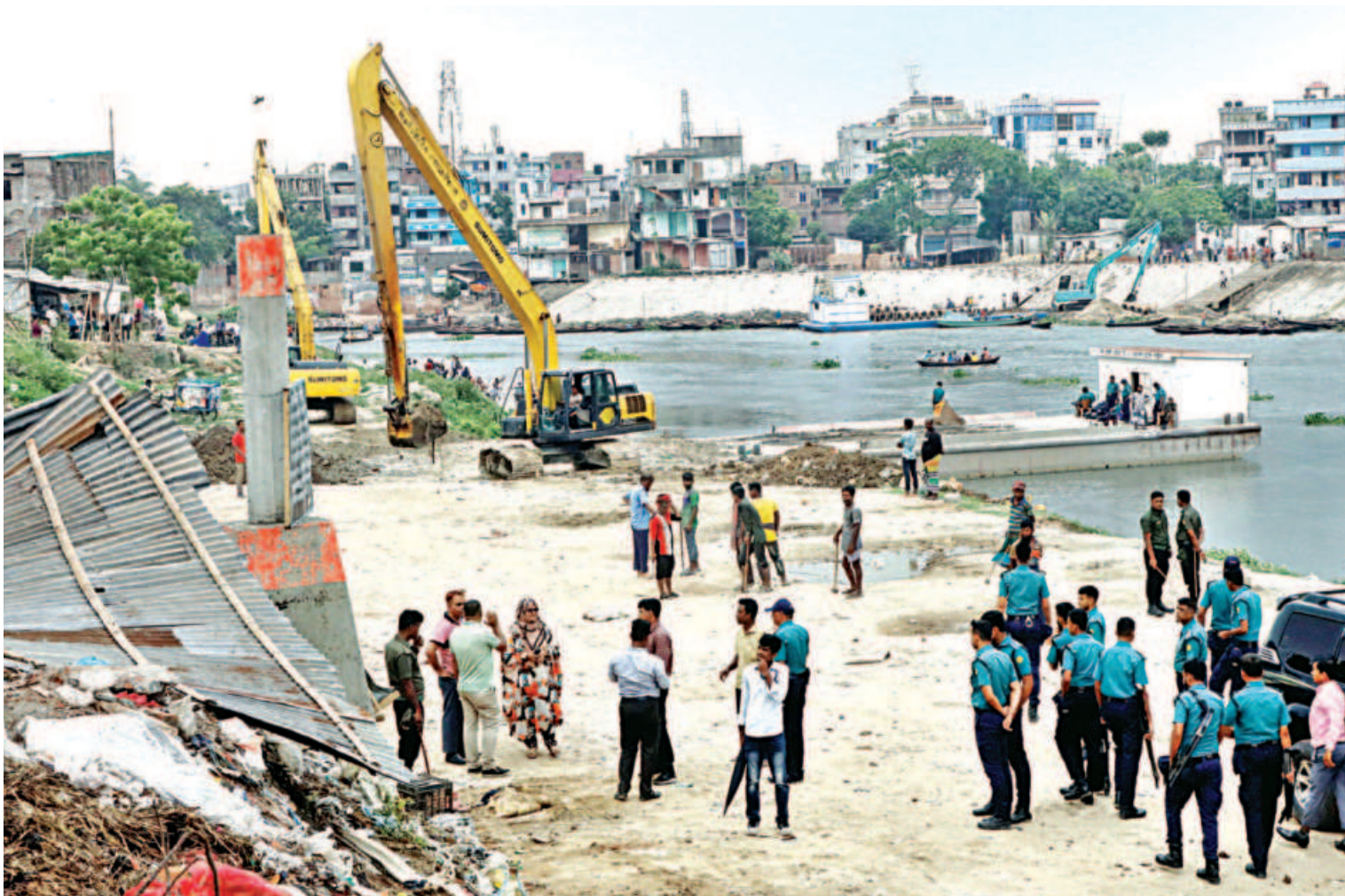
Bangladesh Inland Water Transport Authority conducts a drive to evict river grabbers along the Turag in the capital's Sinnirtek area yesterday. The BIWTA cleared a truck stand and knocked down 17 makeshift shops during the drive to recover 0.4 acres.

RELATED STORY ON PAGE 12 SEE PAGE 2 COL 4