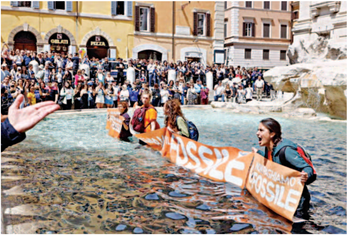
Climate activists hold a banner after pouring vegetable charcoal in the Trevi Fountain water, during a demonstration against fossil fuels, in Rome, Italy yesterday.

REUTERS, Hiroshima US President Joe Biden yesterday said the Group of Seven nations were agreed in their approach to China and the need to diversify their supply chains so they are not dependent on one country. "We're not looking to decouple from China. We're looking to de-risk and diversify our relationship with China," Biden told reporters in Hiroshima, Japan, at the conclusion of a meeting of world leaders. He added that he expected a thaw in frosty relations with China "shortly" after strains caused by an incident earlier this year when the United States shot down a Chinese balloon that flew over sensitive military sites.