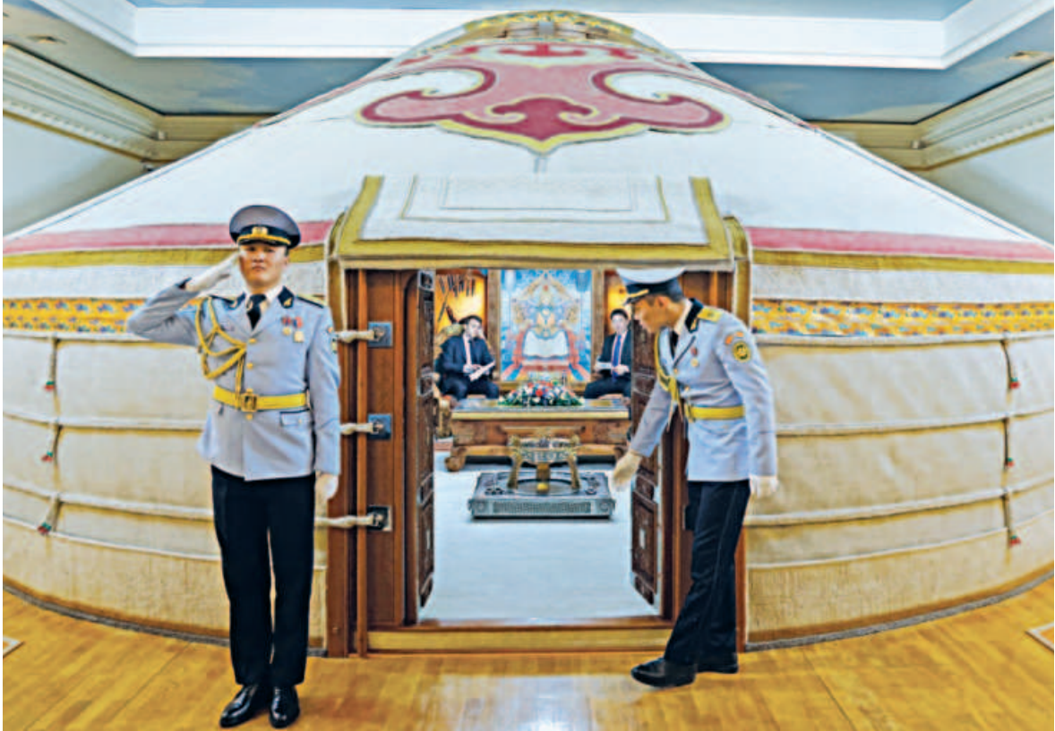
Mongolia's President Ukhnaagiin Khurelsukh, right, speaks with France's President Emmanuel Macron inside a traditional yurt during a meeting at the Government Palace in Ulaanbaatar, Mongolia yesterday.