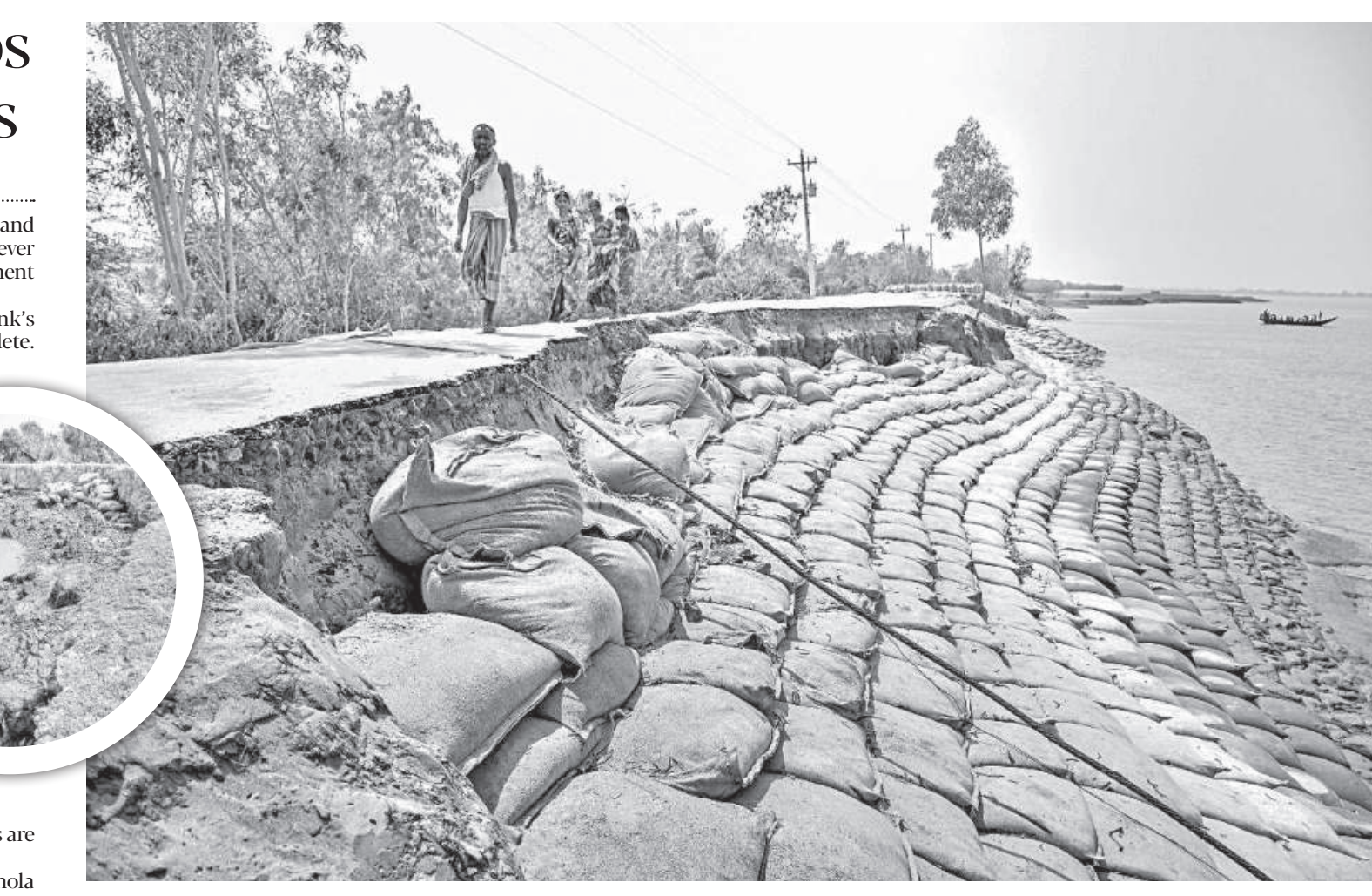
Inhabitants of Sutarkhali and Kamarkhola unions in Khulna's Dacope upazila find themselves gripped by panic as an embankment constructed by the Water Development Board begins to crumble. As the embankment, part of the Coastal Dam Development Project, nears completion; sections, notably in Gunari village of Sutarkhali union, have already been devoured by the river.