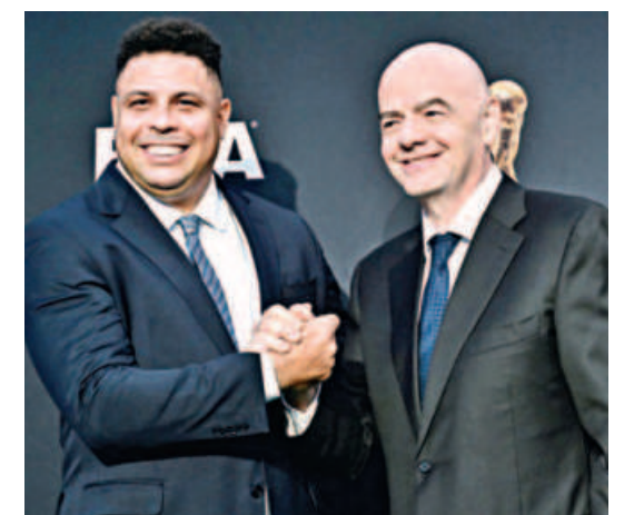
Brazil's World Cup winning forward Ronaldo and FIFA president Gianni Infantino graced the 2026 World Cup official logo unveiling ceremony on Wednesday in Los Angeles.

Even when City took their foot off the gas after the break, Manuel Akanji's deflected goal and Julian Alvarez's cool finish in stoppage time gave the scoreline a fair reflection.