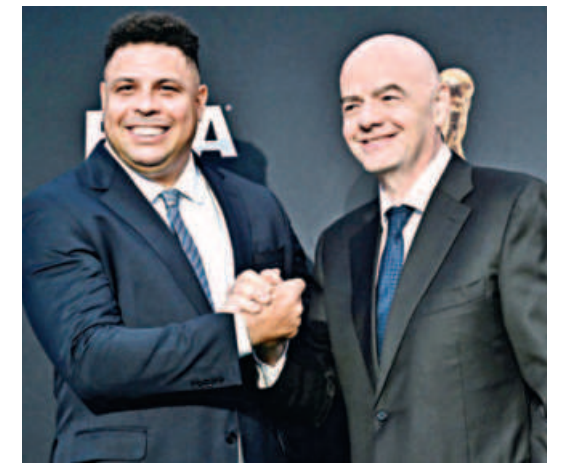
Brazil's World Cup winning forward Ronaldo and FIFA president Gianni Infantino graced the 2026 World Cup official logo unveiling ceremony on Wednesday in Los Angeles.

Even when City took their foot off the gas after the break, Manuel Akanji's deflected goal and Julian Alvarez's cool finish in stoppage time gave the scoreline a fair reflection.