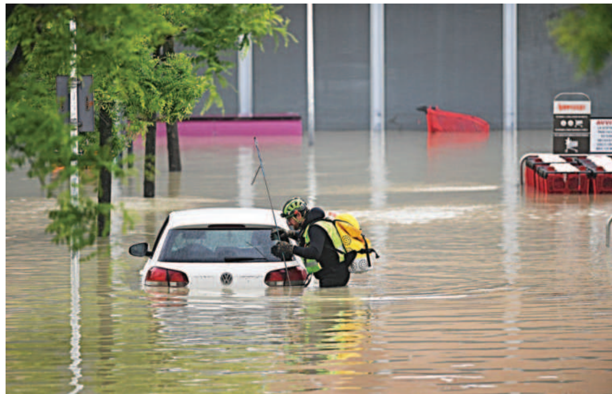
A speleological alpine rescuer looks in a car for missing persons near a supermarket in a flooded area in Cesena, Italy yesterday. Heavy rains have caused major floodings in central Italy, where trains were stopped and schools were closed in many towns while people were asked to leave the ground floors of their homes and to avoid going out.