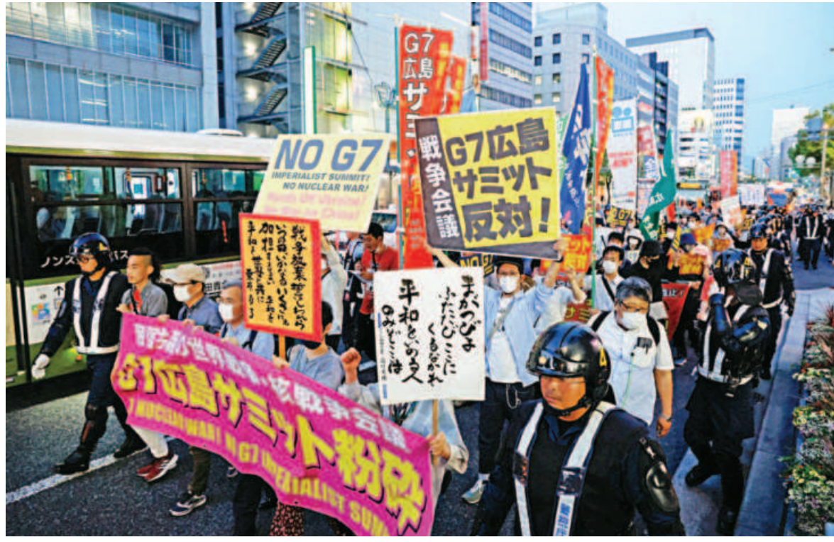
Anti-G7 protesters walk through the city, ahead of the G7 summit, in Hiroshima, Japan yesterday. Rich nations should boost financial and technical support to poorer countries to help them tackle climate change, a senior Japanese environment ministry official said ahead of the May 19-21 talks.