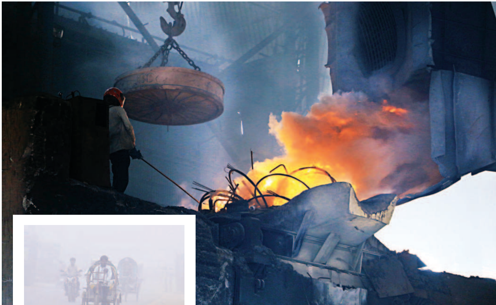
Scrap iron is being melted in a furnace at a factory in the capital's Shyampur. This process of producing rods creates clouds of fumes and smoke that engulf the area adjacent to Dhaka-Narayanganj road, inset . The photos were taken around 1:00pm on Sunday.