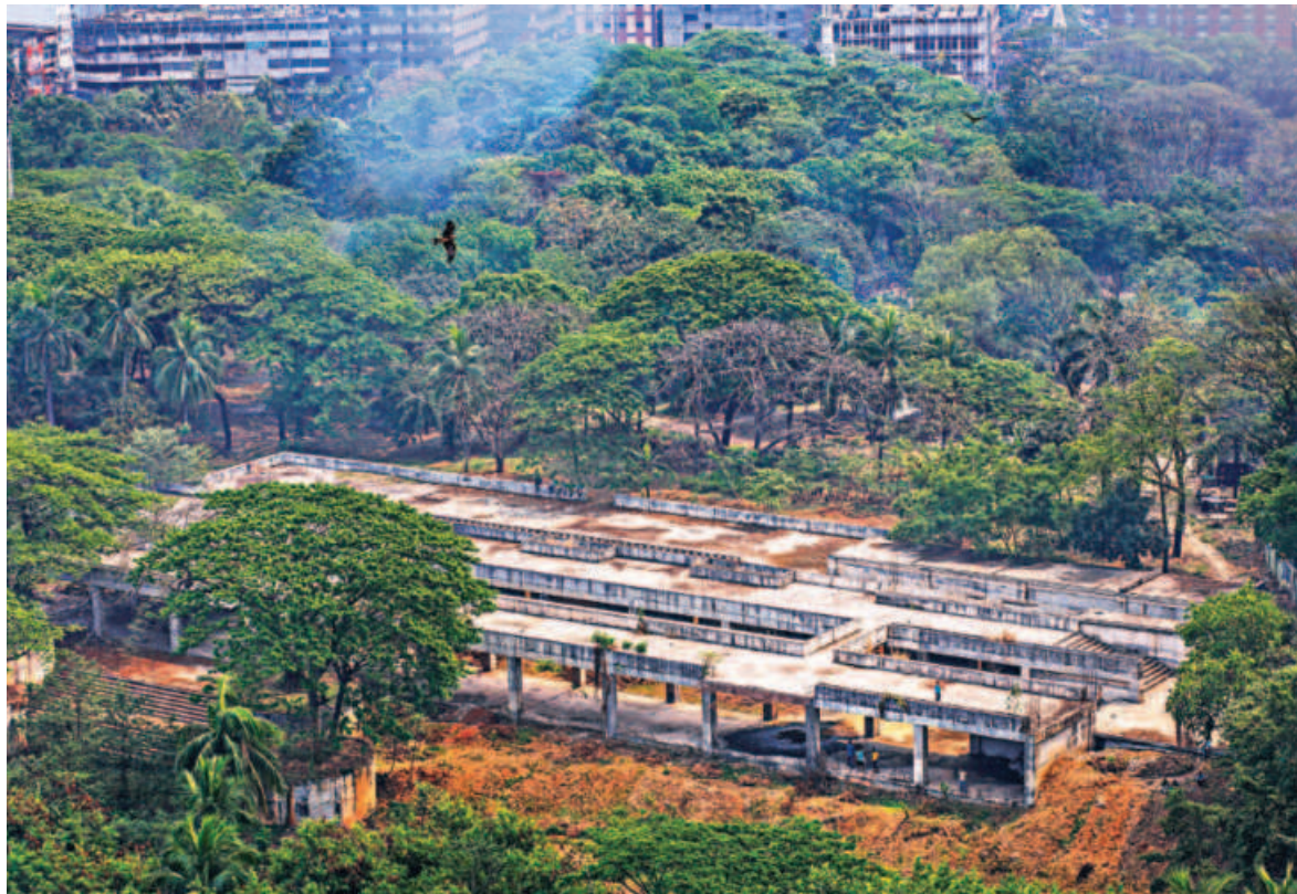
The parking space at the Osmani Udyan lies unusable and has turned into a hub for criminal activities since the DSCC closed it down for renovation five years ago. The failure to complete the project has now resulted in the complete abandonment of the space. The photo was taken recently.