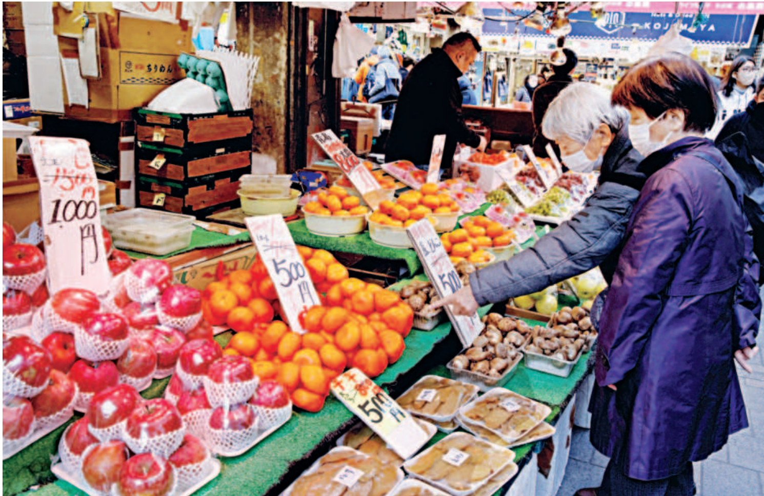
People shop daily necessities at a market in Tokyo. The 0.4 per cent rise in Japan's gross domestic product beat market expectations of 0.2 per cent, after hopes of a rebound fell flat in the final quarter of last year.

Turnover of the port city bourse surged more than double to Tk 22.5 crore from the previous day's Tk 8 crore.