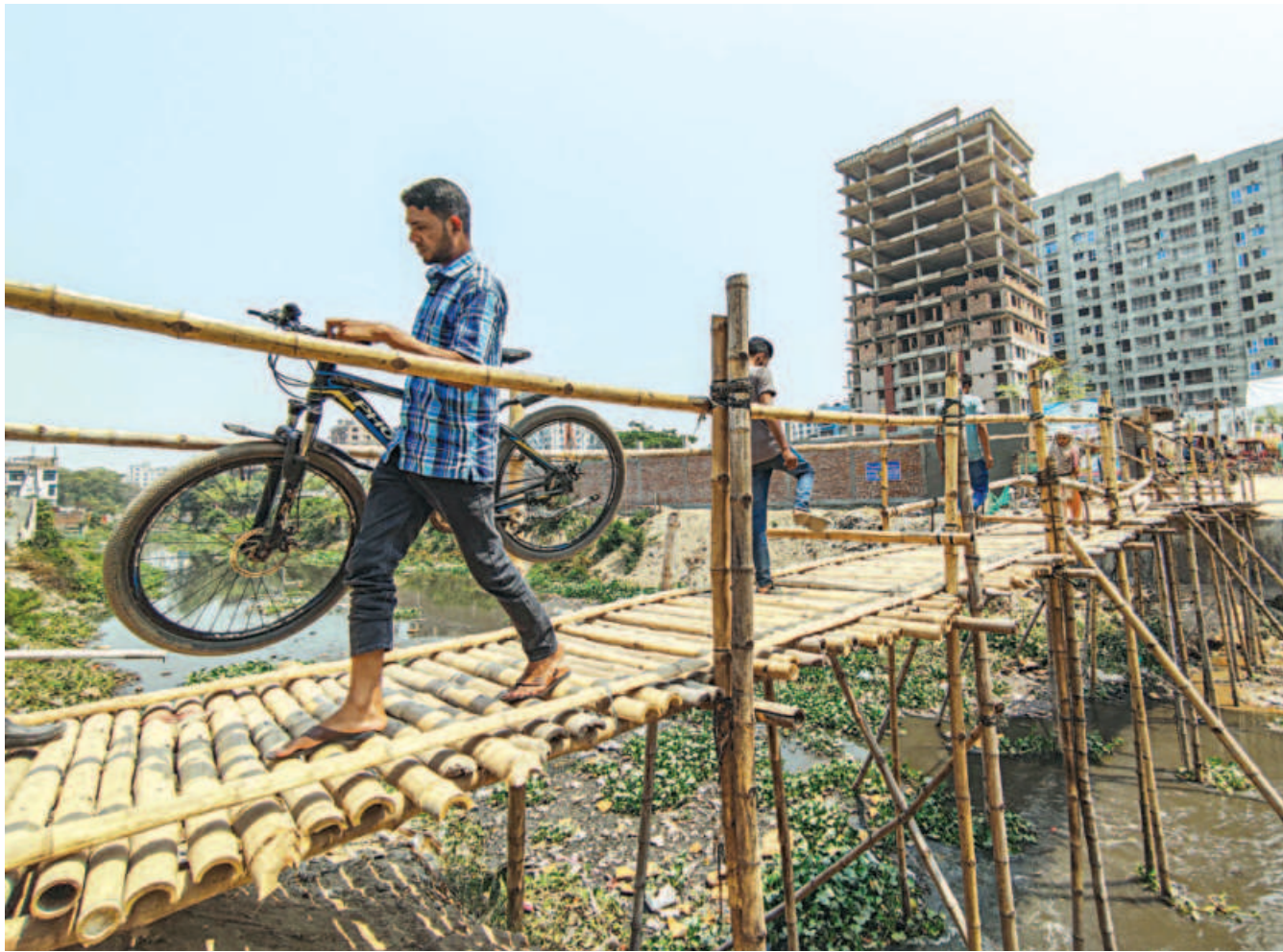
Locals of Bosila and Chandrima Housing in Mohammadpur regularly build such bamboo bridges to cross the Ramchandrapur Canal, located between the two areas. While it is risky for them to cross it, they claimed the authorities concerned have never taken the initiative to build a concrete bridge there.

School Based Assessment should be re-designed as part of remedial education to help students with severe learning gaps.