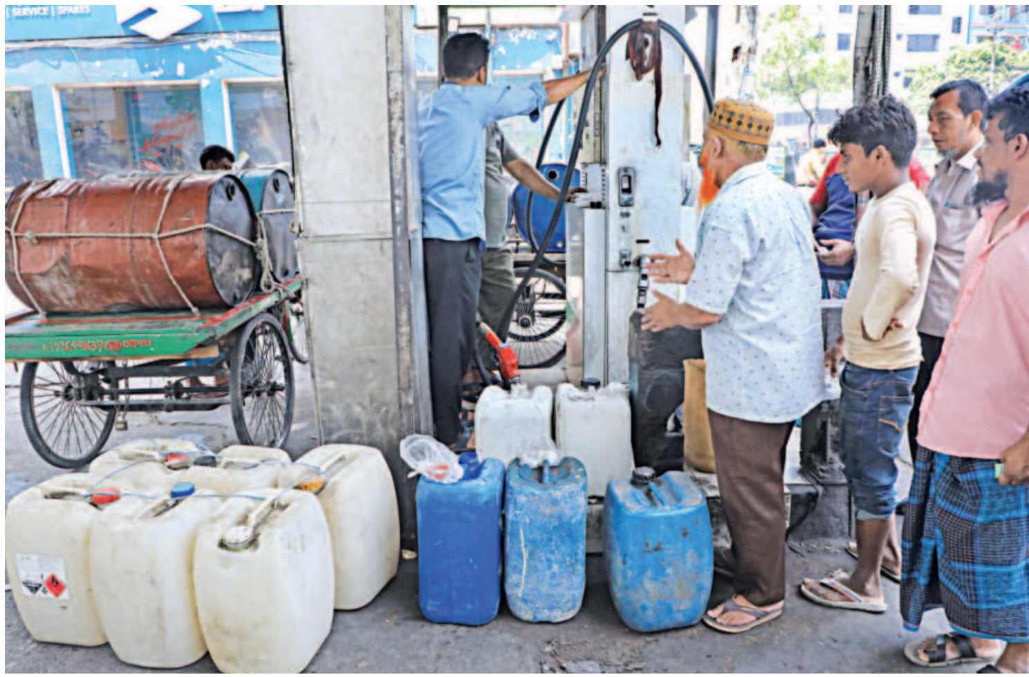
With frequent load shedding in the capital in the last couple of days, the demand for diesel has increased. To make sure there's enough diesel for running generators in office and residential buildings, many were queuing at filling stations with containers. This photo was taken in Madhya Badda area recently.