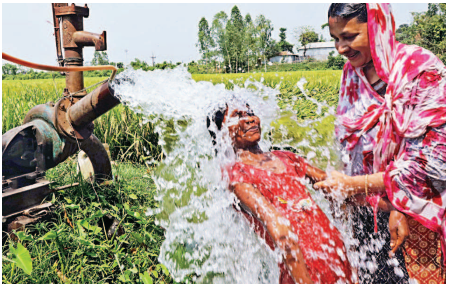
Amid sweltering heat, a mother-daughter duo finds respite by playfully dipping their heads beneath the cascading flow of a nearby pump. Laughter echoes in the air, capturing the essence of the simple pleasure of cool relief and togetherness. This photo was taken in Tangail's Nagarpur area recently.