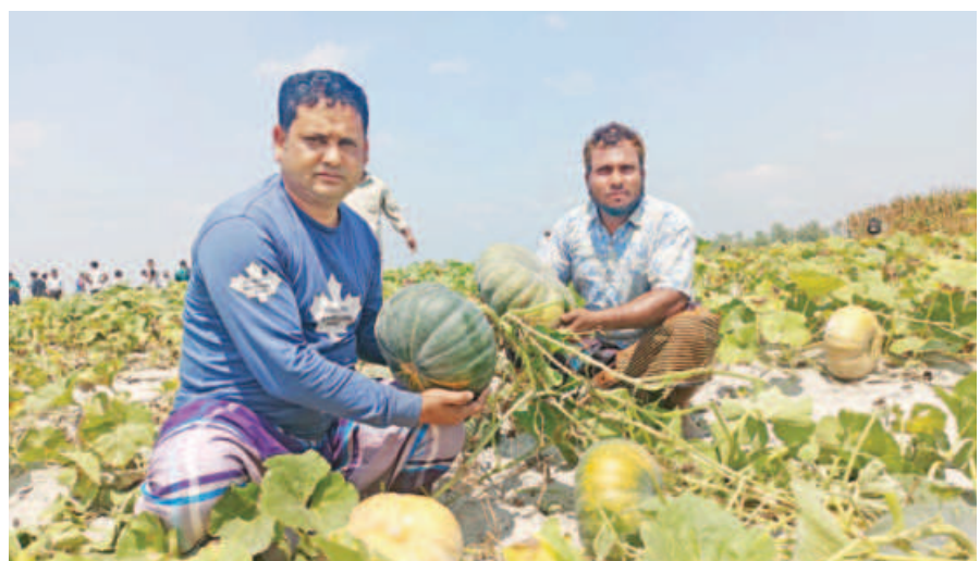
Once an abandoned char land has now turned into a pumpkin field. The photo was taken from Jamirbari village in Lalmonirhat's Kaliganj upazila.

Local farmers will be benefited if the char lands are brought under various crop cultivation.