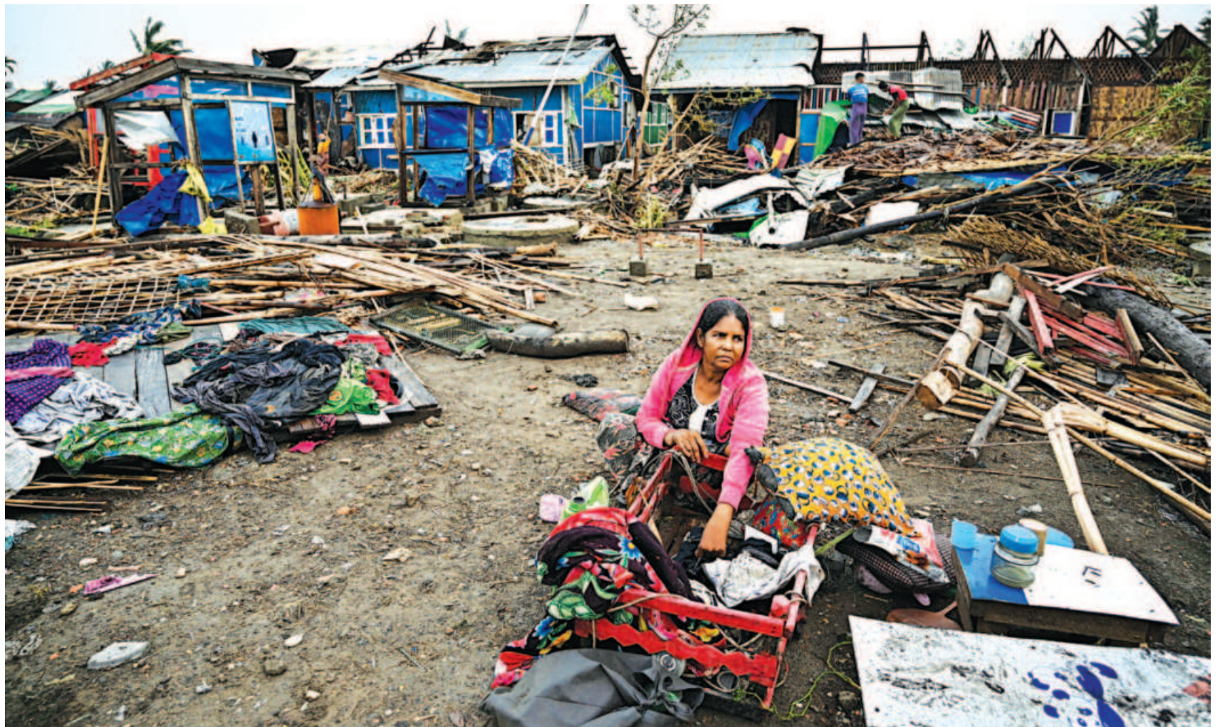
A Rohingya woman washes clothes past destroyed houses at Basara refugee camp in Sittwe, Myanmar yesterday, a couple of days after Cyclone Mocha made landfall.