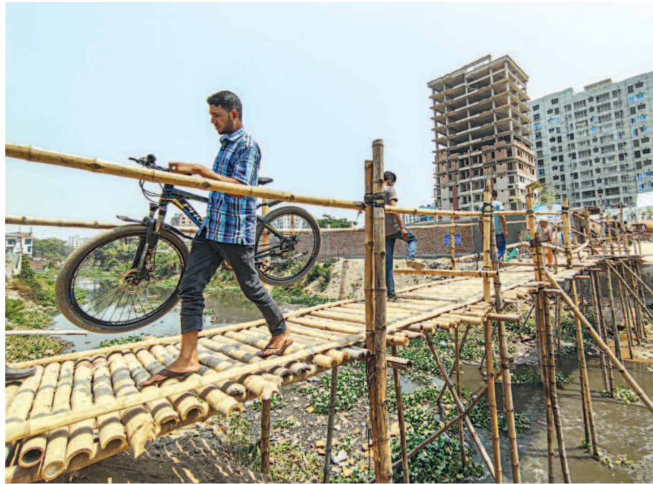
Locals of Bosila and Chandrima Housing in Mohammadpur regularly build such bamboo bridges to cross the Ramchandrapur Canal, located between the two areas. While it is risky for them to cross it, they claimed the authorities concerned have never taken the initiative to build a concrete bridge there.

School Based Assessment should be re-designed as part of remedial education to help students with severe learning gaps.