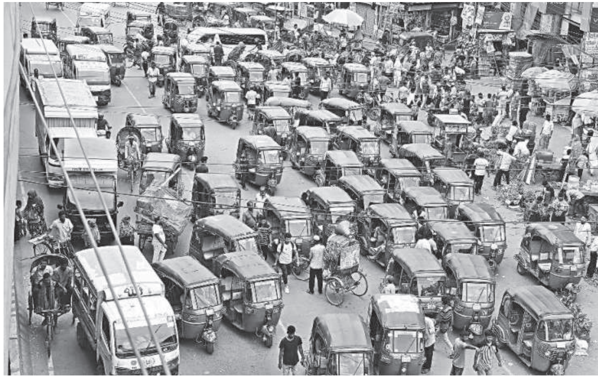
Chaos unfolds as a fleet of CNG-run three-wheelers occupies almost the entire road in the Jurain Rail Gate area. Due to this illegal parking, vehicular movement often comes to a grinding halt. Despite the inconvenience faced by commuters, authorities seemed to have turned a blind eye to the situation. This photo was taken recently.

On May 17, 2017, a Narayanganj court sentenced 23 people to death.