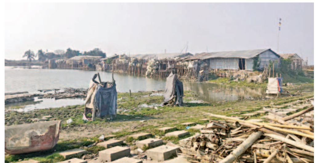
Sandwip two months after cyclone Sitrang last year.

During a recent visit to Alakdia village, this correspondent found that a large portion of an adjacent dyke has broken down, making way