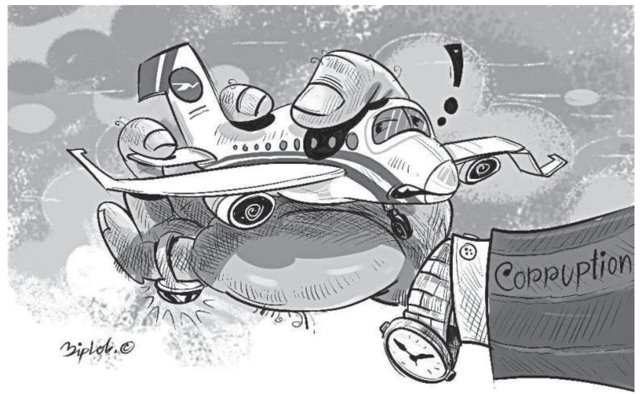
ILLUSTRATION: BIPOB CHAKROBORTY

Moreover, the national flag carrier already has a General Sales Agent (GSA) in Saudi Arabia and station offices in