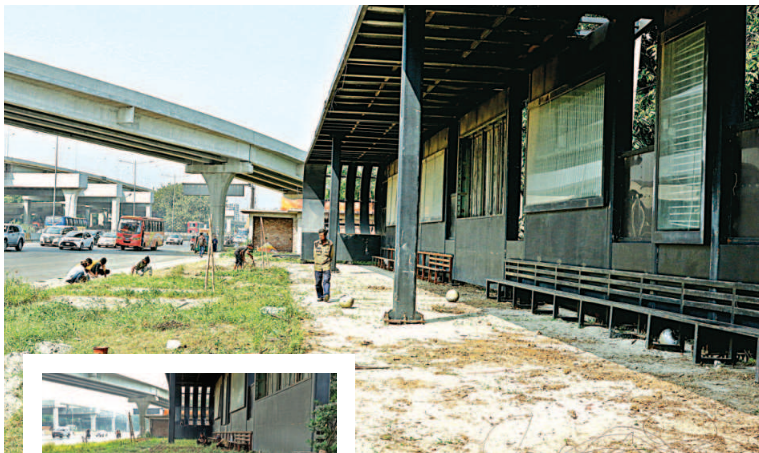
A passenger shed, previously being misused as a plant nursery, at a bus stop near the Golf Club Gate in the capital, is now being cleaned up and prepared for bus passengers' use. DNCC workers said the initiative was taken by the authorities concerned three days ago, after The Daily Star ran a photo (inset) of the shed's previous state on May 9. The photo was taken on Tuesday.