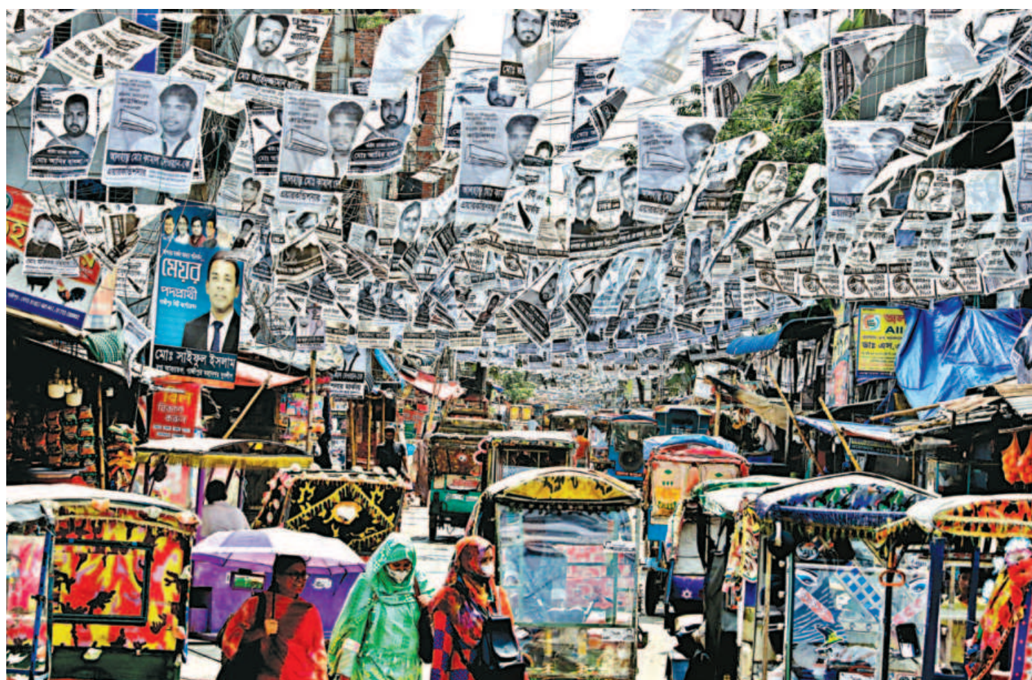
The Auchpara area in Tongi is littered with posters as the campaign for the Gazipur City Corporation election gains momentum ahead of the May 25 polls. Supporters of the mayor and councillor candidates are campaigning in the city to woo voters. The photo was taken yesterday.