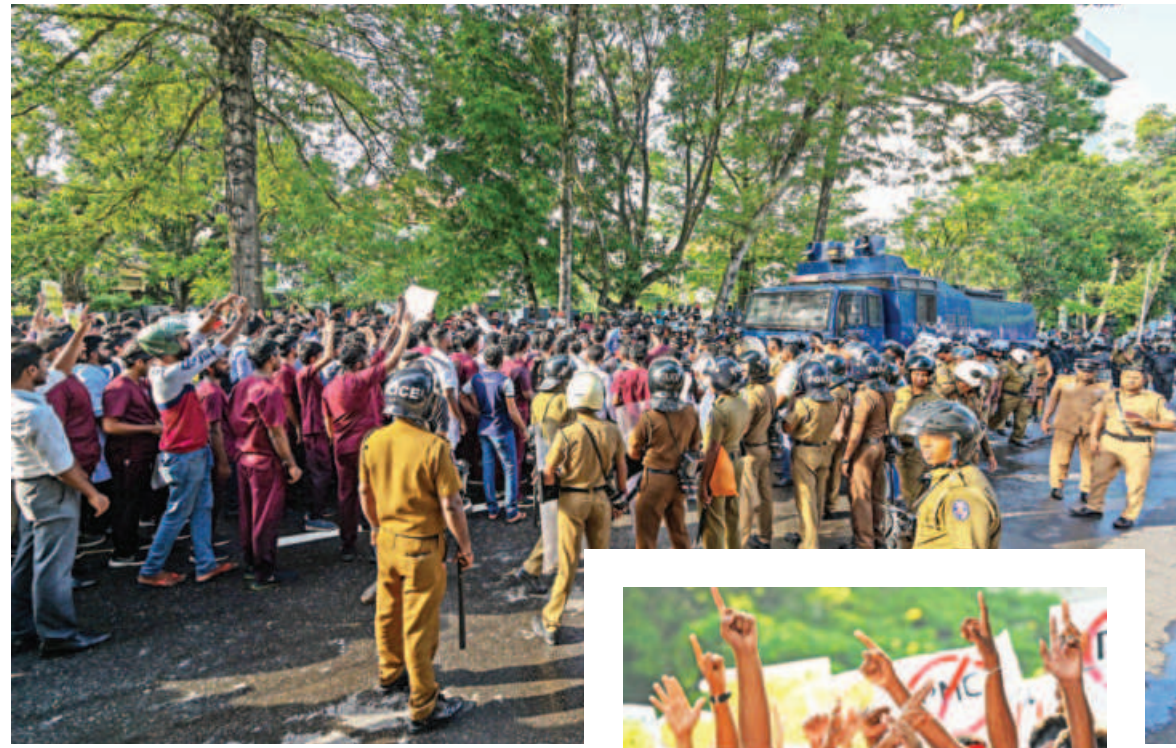
Police stand guard as university students shout slogans demanding the closing of private medical universities during an anti-government demonstration in Colombo, Sri Lanka yesterday.

The commander-in-chief of Ukraine's armed forces, Valeriy Zaluzhnyi said all had been successfully intercepted. However, Russia said that all the targets assigned by its military in an overnight missile barrage on Ukraine had been hit.