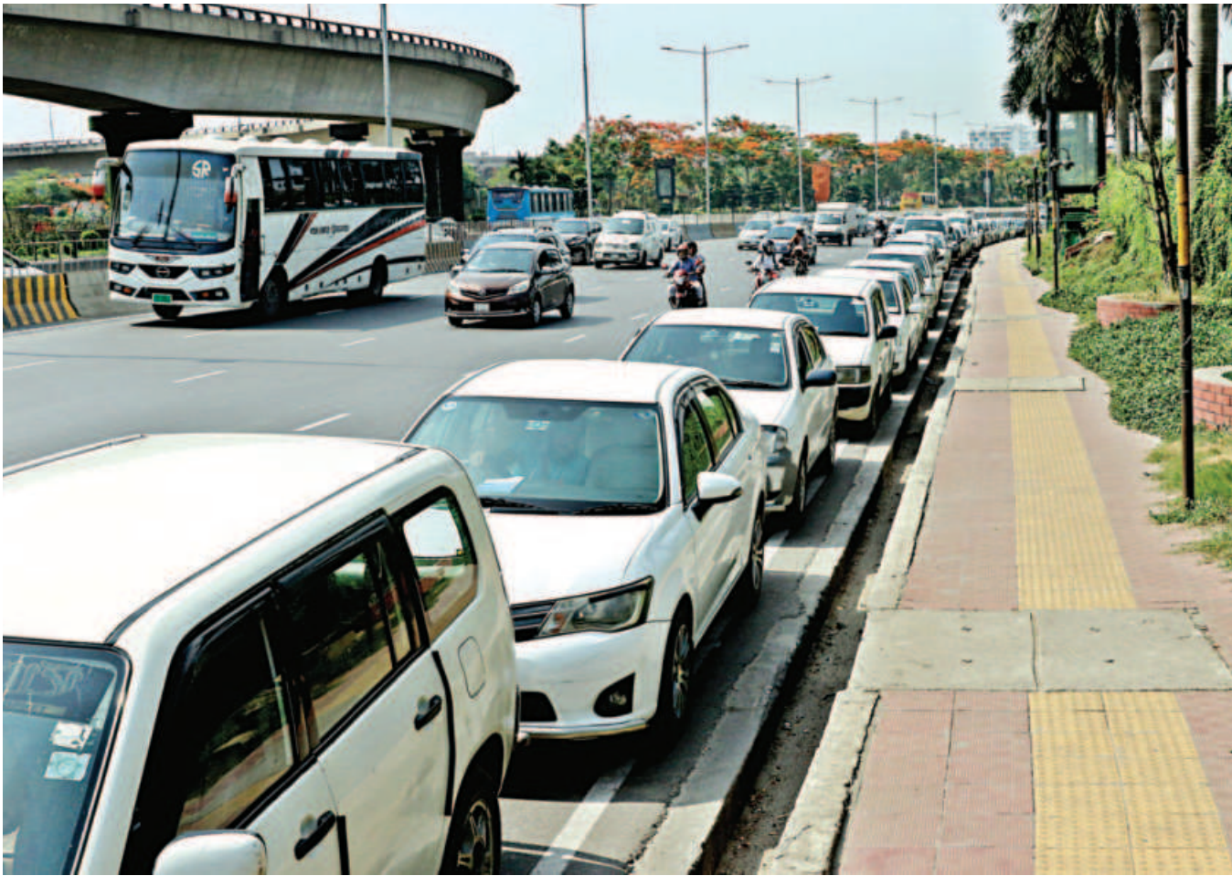
Cars wait in a long queue outside a CNG filling station in the capital's Nikunja area around 9:00am yesterday. Many other filling stations in the city saw long queues of vehicles mainly due to frequent load-shedding, which slowed refill services.