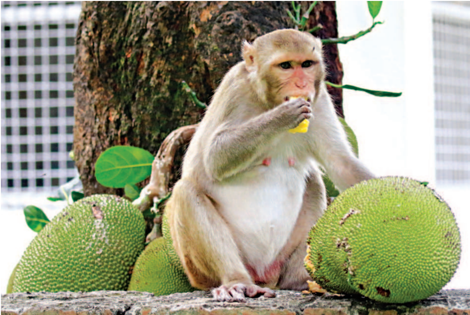
MONKEY BUSINESS ... With summer fruits well into ripeness, a monkey reaps the benefits by feasting on jackfruits that have just fallen from a tree in Sylhet city's Shahi Eidgah area. The photo was taken yesterday.