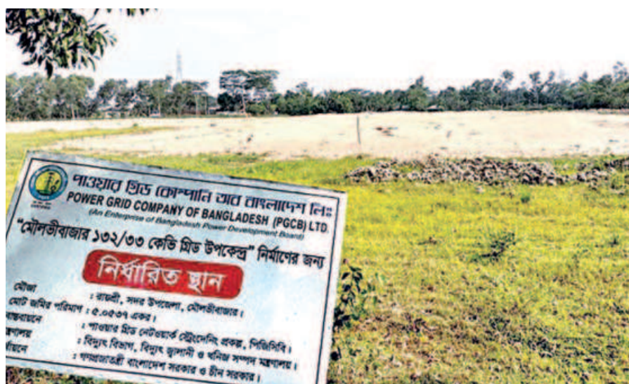
Construction work of Moulvibazar 132/33 KV Grid Substation at Raishree village in Moulvibazar Sadar upazila is going on at a slow pace.