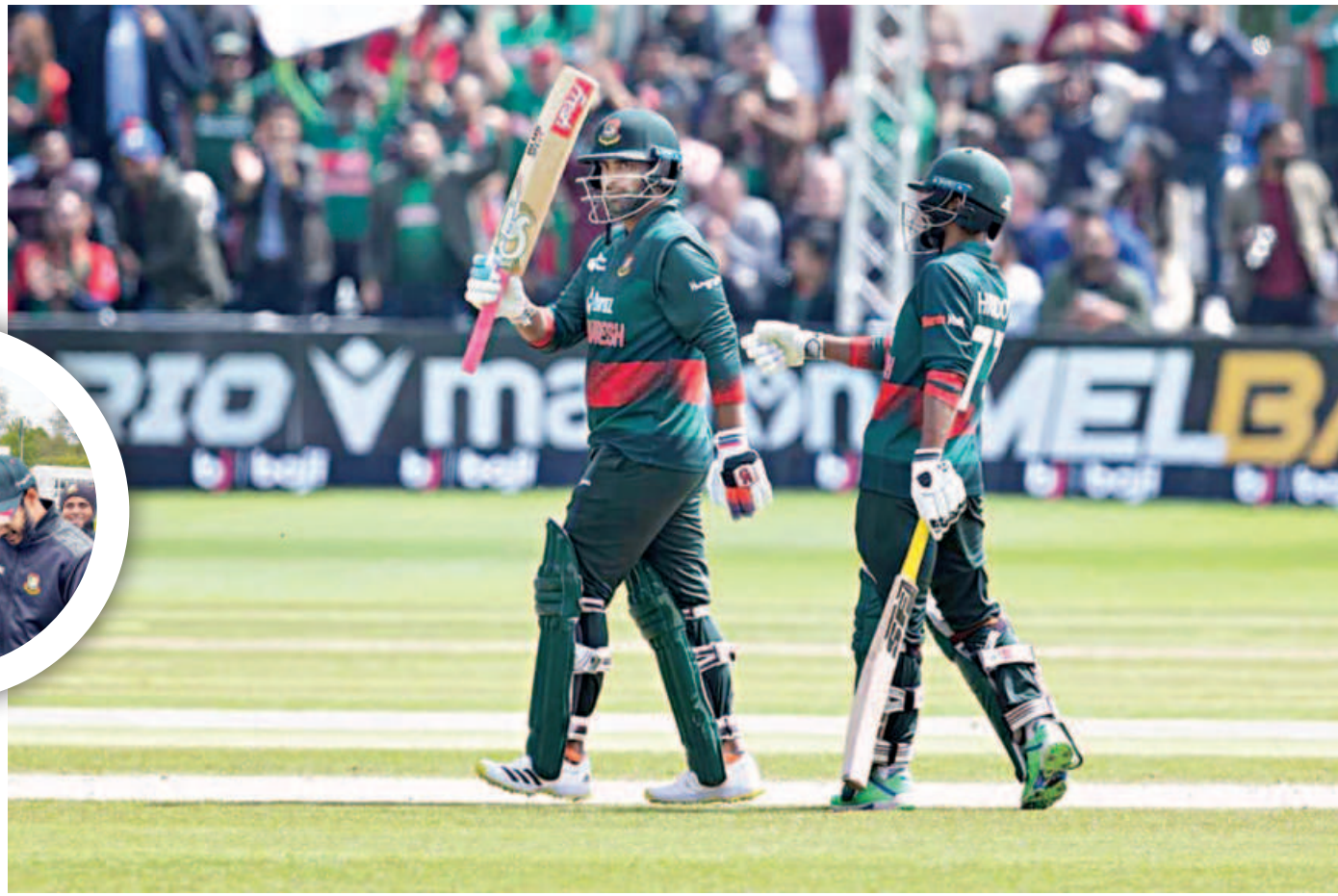
Bangladesh ODI skipper Tamim Iqbal raises his bat after having ended a nine-match half-century drought during the third and final ODI against Ireland in Chelmsford yesterday, but his 82-ball 69 left a lot to be desired.