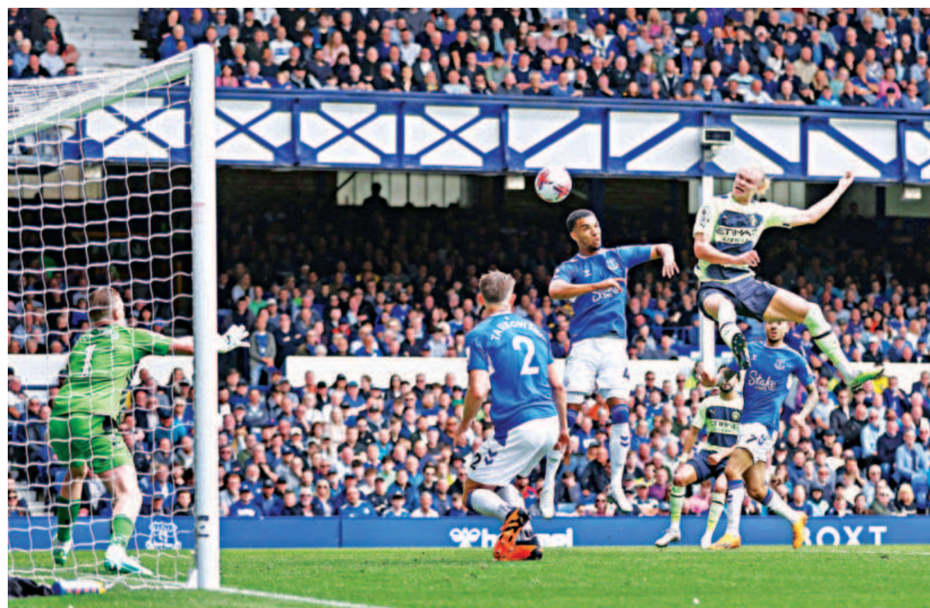
Extending his single-season Premier League scoring record to 36 goals, Manchester City striker Erling Haaland leaps and thumps a header to score the game's final goal following a brace from Ilkay Gundogan as City maintains their lead ahead of Arsenal with a 3-0 win at Everton yesterday.