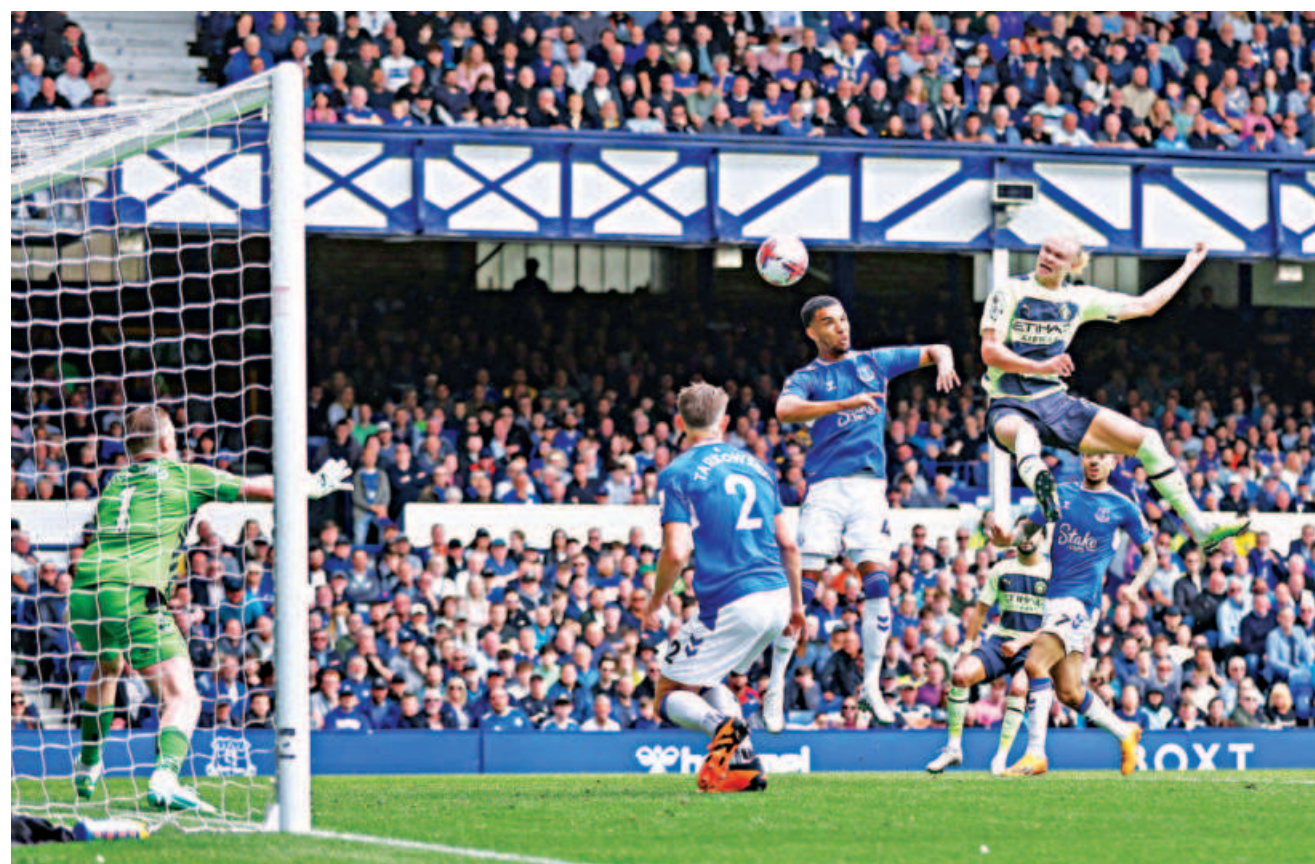
Extending his single-season Premier League scoring record to 36 goals, Manchester City striker Erling Haaland leaps and thumps a header to score the game's final goal following a brace from Ilkay Gundogan as City maintains their lead ahead of Arsenal with a 3-0 win at Everton yesterday.