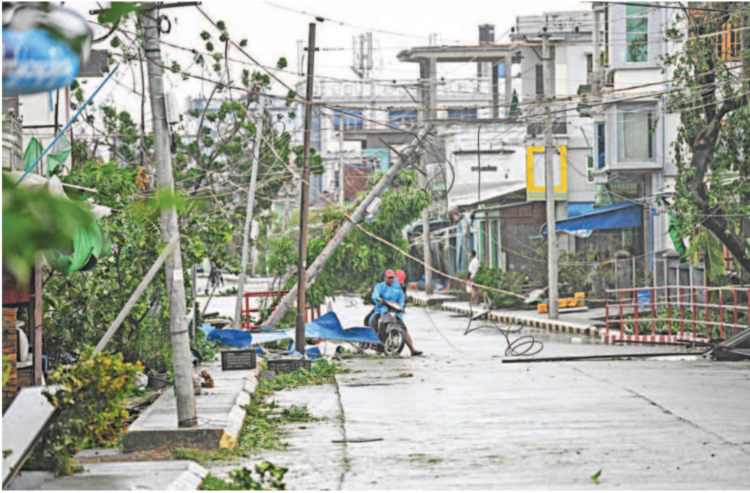
Local residents ride their motorbike amid a damaged street after Cyclone Mocha crashed ashore, in Kyauktaw in Myanmar's Rakhine state yesterday. Thousands of people hunkered down in monasteries, pagodas and schools, seeking shelter from the powerful storm that slammed into the coast of Myanmar, tearing the roofs off buildings and killing at least three people.

An opposition win would bring no guarantees that