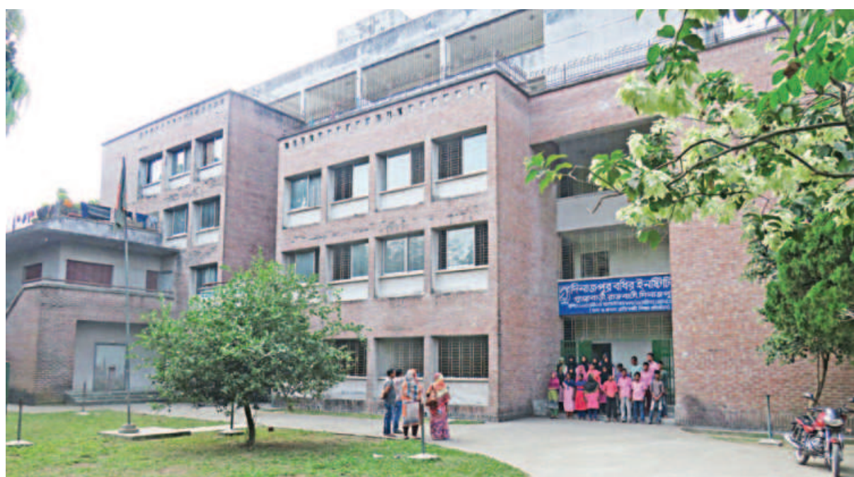
This school for the speech and hearing-impaired children in Dinajpur town has been suffering from various problems amid serious fund crisis.

In order to pay all the expenses they need at least Tk 2.5 lakh per month, the head teacher added.