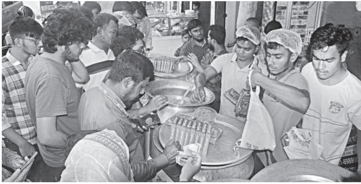
Many people have been forced to buy food from restaurants as gas supply remains suspended in Chattogram. Meanwhile, a CNG driver fills his vehicle with octane at a filling station due to unavailability of gas. The city has been facing an acute gas crisis for the past two days, caused by the suspension of supply from the two floating LNG terminals at Maheshkhali due to the cyclone Mocha. The photos were taken yesterday.