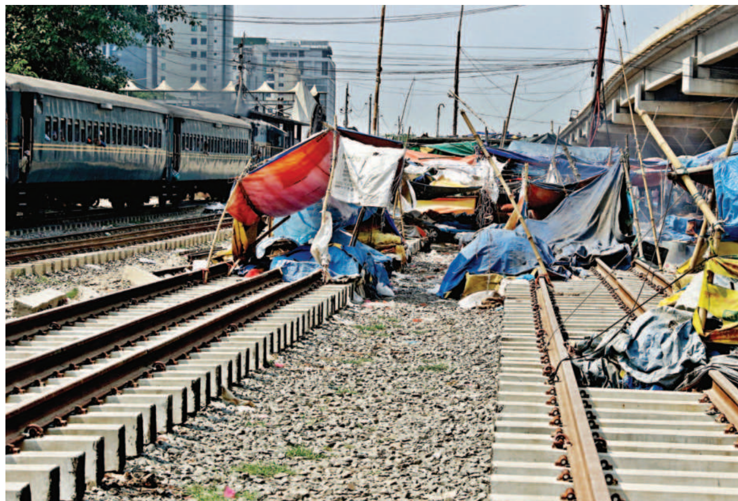
A makeshift fruit market has sprung up on the dual-gauge railway lines recently laid in Khilhet as part of the Tongi-Kamalapur rail route. Authorities concerned appear to be doing nothing about it. The lines are still under construction and not yet operational.