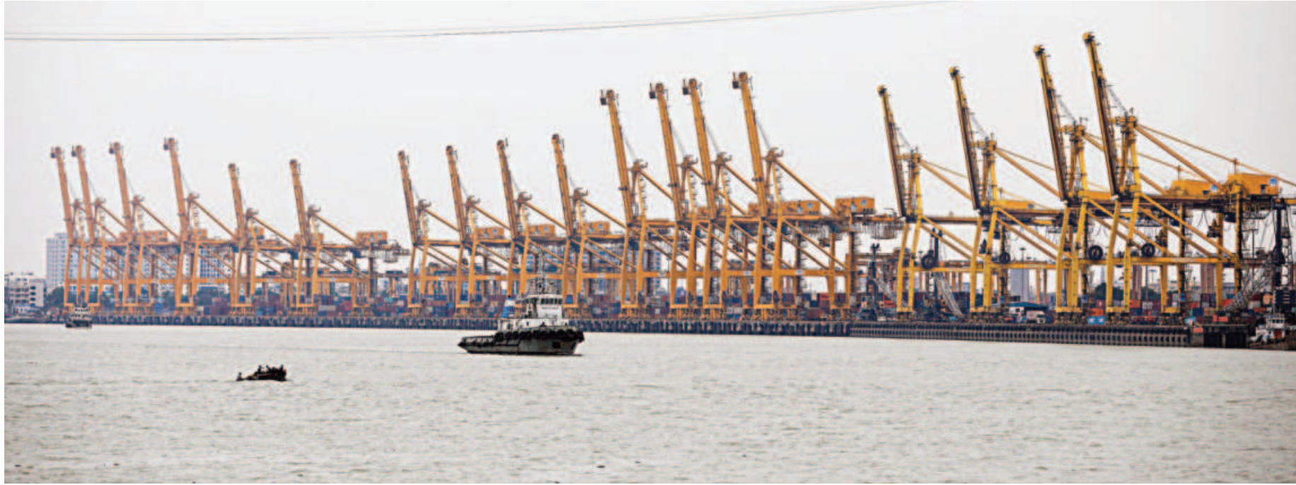
All vessels anchored at various jetties of Chattogram port were sent to the outer anchorage by yesterday morning as a precautionary measure in order to avoid any major damage that may be inflicted by Cyclone Mocha. The photo was taken yesterday at noon.