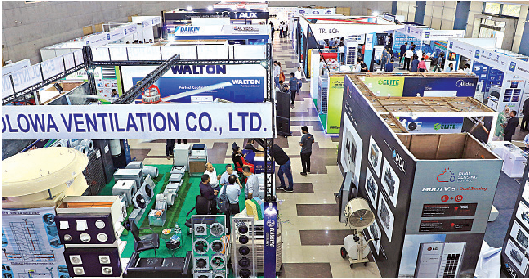
The three-day SAFECON 2023, a platform for firms to showcase their latest technology in building safe and sustainable infrastructure, is now underway at the International Convention City Bashundhara in Dhaka. The picture was taken yesterday.