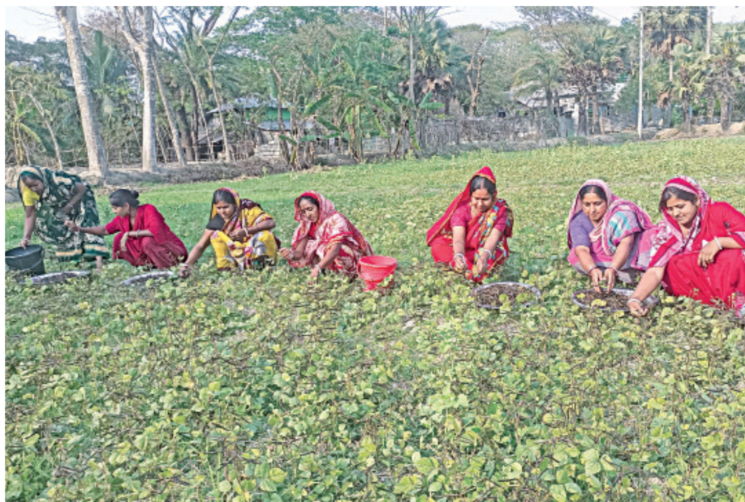
Women are busy harvesting moong lentil in Pakhimara village in Patuakhali's Kalapara upazila in order to prevent any damage the crop might suffer due to cyclonic storm Mocha. Data from the agriculture department showed that the popular pulse variety has been grown on 85,432 hectares of land in the coastal district this year with a production target of 1.02 lakh tonnes. So far, 92 per cent of the crop has been harvested. The photo was taken yesterday.

The company's factories are located in Dhaka and Savar. It has a green leaf threshing plant in Kushtia and a green leaf redrying plant in Manikganj.