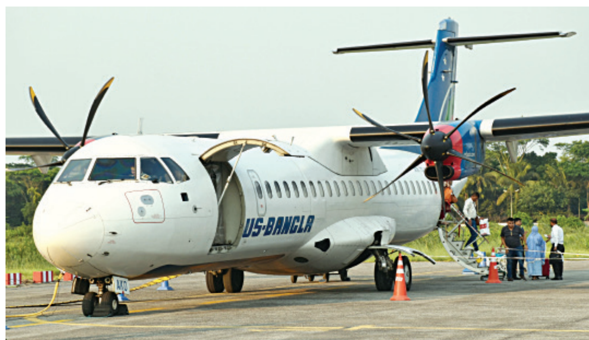
Recovery from Covid-19 fallout has been slow for domestic airlines in Bangladesh as the overall passenger count has yet to reach pre-pandemic levels. In this picture taken on Wednesday, a carrier of US-Bangla Airlines is seen on the runway of Barishal Airport.

This was up 16 per cent year-on-year and just below that three years ago.