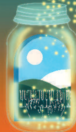
ILLUSTRATION: SYEDA AFRIN TARANNUM