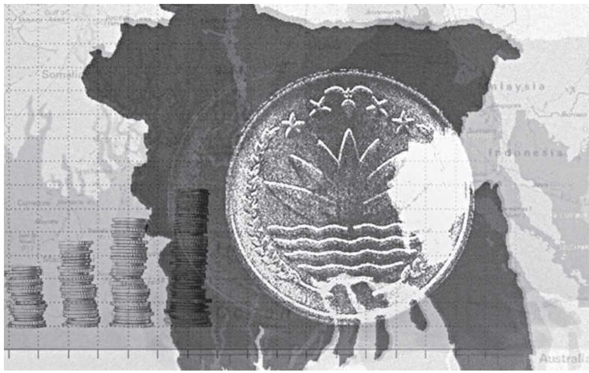
ILLUSTRATION: REHNUMA PROSHOON