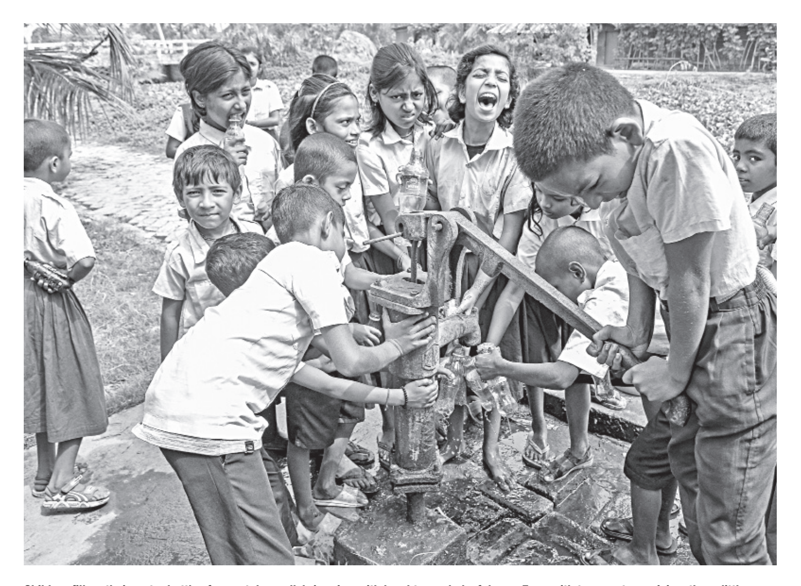
Children fill up their water bottles from a tube-well, brimming with laughter and playfulness. Even with temperatures rising, these little ones find relief and joy in the simplest of things. This photo was taken in Khulna's Dumuria area recently.

Fazr Zohr Asr Maghrib Esha AZAN 4-10 12-45 5-00 6-36 8-00 JAMAAT 4-45 1-15 5-15 6-40 8-30 SOURCE: ISLAMIC FOUNDATION