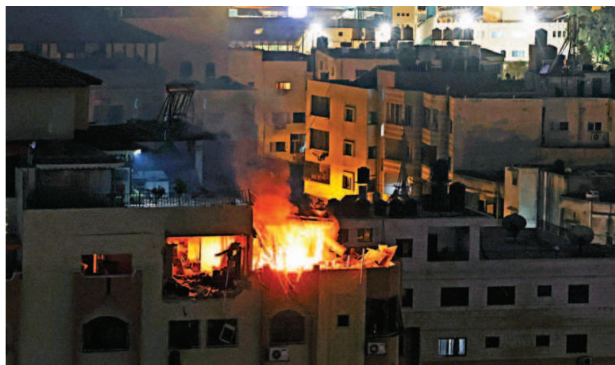
A fire breaks out at an apartment following an explosion in Gaza City, Palestinian Territories yesterday. Israel killed three Islamic Jihad commanders and 10 civilians in surprise airstrikes in Gaza yesterday, Palestinian officials said.