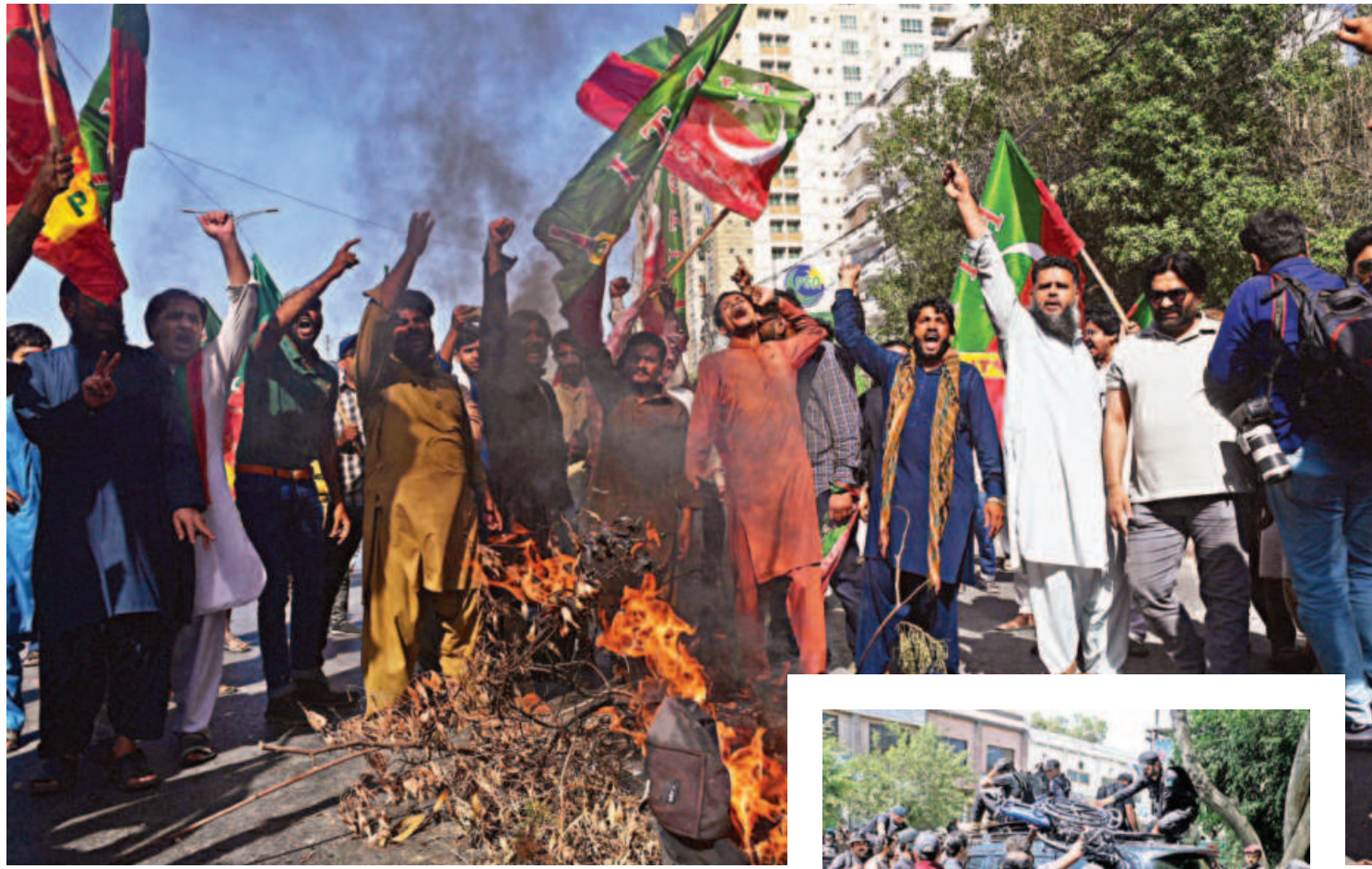
Pakistan Tehreek-e-Insaf party activists and supporters of former Pakistan prime minister Imran Khan shout slogans next to a fire as they block a road during a protest against the arrest of their leader in Karachi, Pakistan yesterday. Inset, Pakistan security forces guard a vehicle carrying Imran Khan after his arrest at a court in Islamabad.

But the party grew hugely during the military-led government of General Pervez Musharraf, becoming a genuine force in the 2013 elections before winning a majority five years later. Running the country proved more difficult than sitting in opposition, however. "I fight till the very last ball," he said in one TV interview.