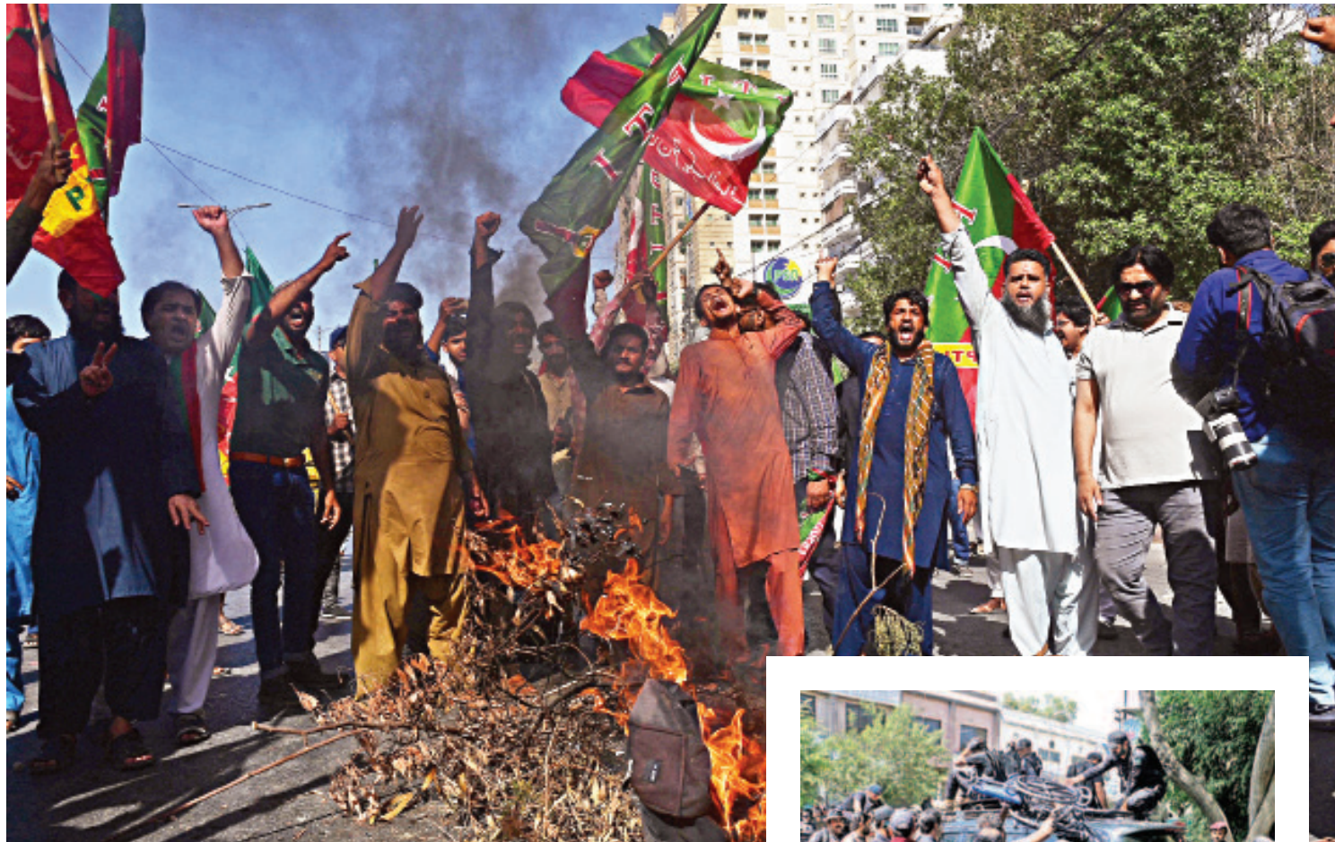
Pakistan Tehreek-e-Insaf party activists and supporters of former Pakistan prime minister Imran Khan shout slogans next to a fire as they block a road during a protest against the arrest of their leader in Karachi, Pakistan yesterday. Inset, Pakistan security forces guard a vehicle carrying Imran Khan after his arrest at a court in Islamabad.

Running the country proved more difficult than sitting in opposition, however. "I fight till the very last ball," he said in one TV interview.