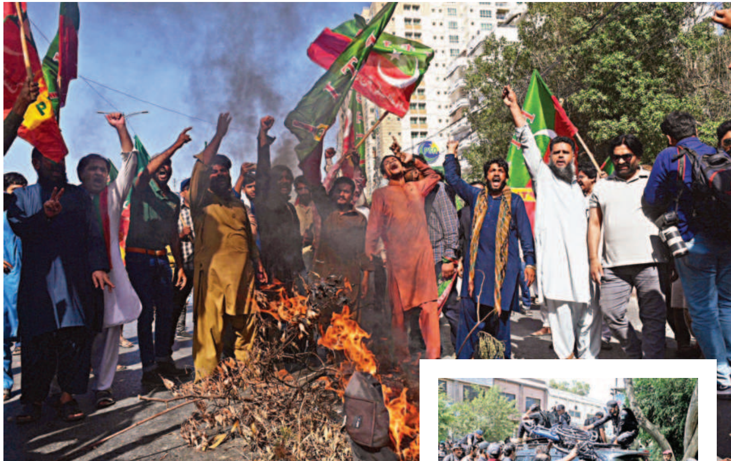
Pakistan Tehreek-e-Insaf party activists and supporters of former Pakistan prime minister Imran Khan shout slogans next to a fire as they block a road during a protest against the arrest of their leader in Karachi, Pakistan yesterday. Inset, Pakistan security forces guard a vehicle carrying Imran Khan after his arrest at a court in Islamabad.

Running the country proved more difficult than sitting in opposition, however. "I fight till the very last ball," he said in one TV interview.