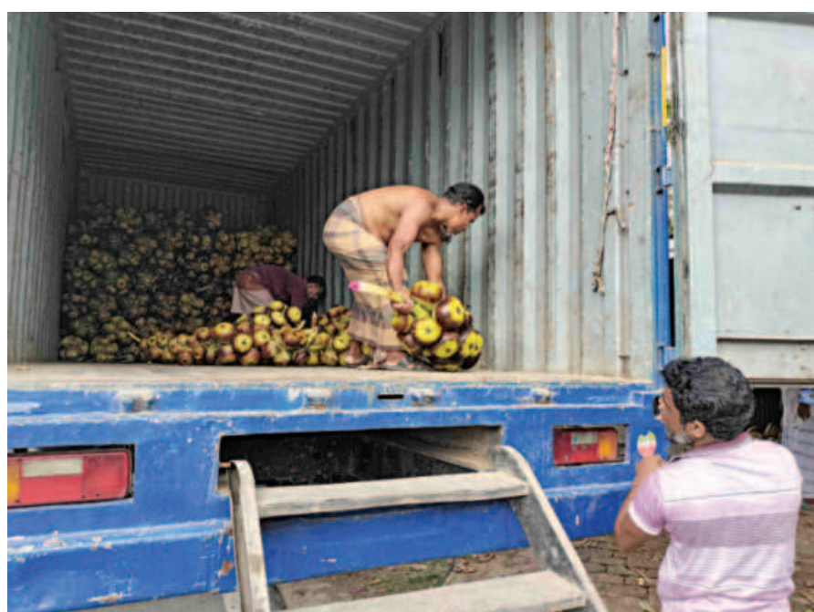
Workers are seen loading tender palm onto a covered-van at Safa village in Pirojpur's Mathbaria upazila.

Interpol has issued a red notice for the arrest of Arav Khan who runs a jeweller's in Dubai.