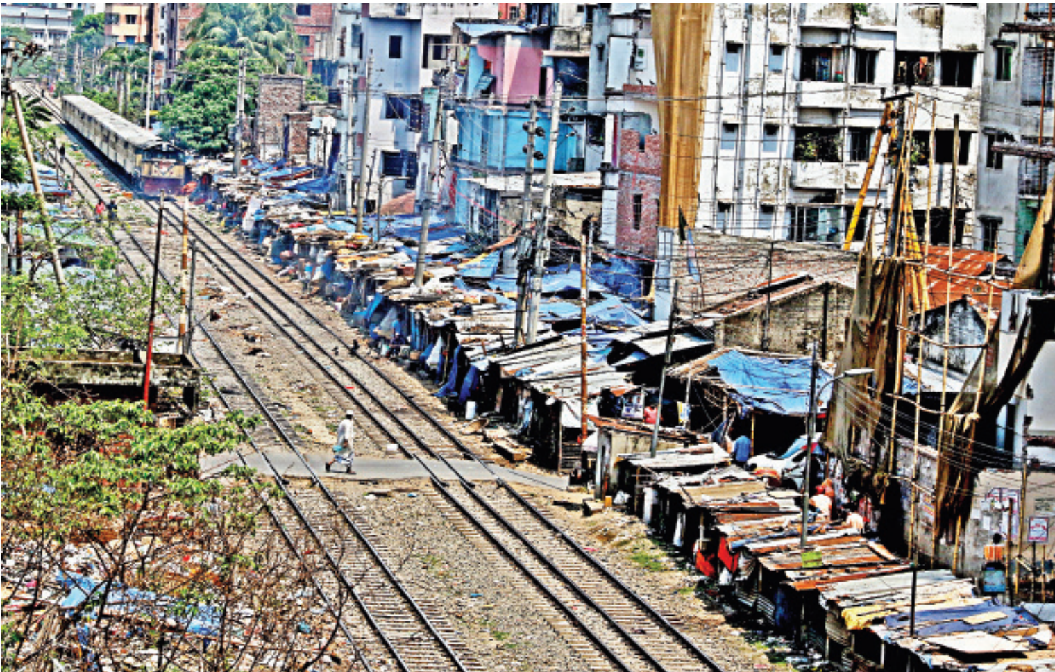
Traders have set up illegal makeshift shops along the rail lines in the capital's Malibagh bazar level crossing area. This exposes people, vehicles and trains to risks. The photo was taken recently.

Contacted yesterday, Rois denied the allegation.