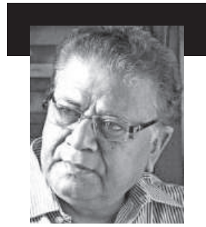
SAMARESH MAJUMDAR 1944-2023