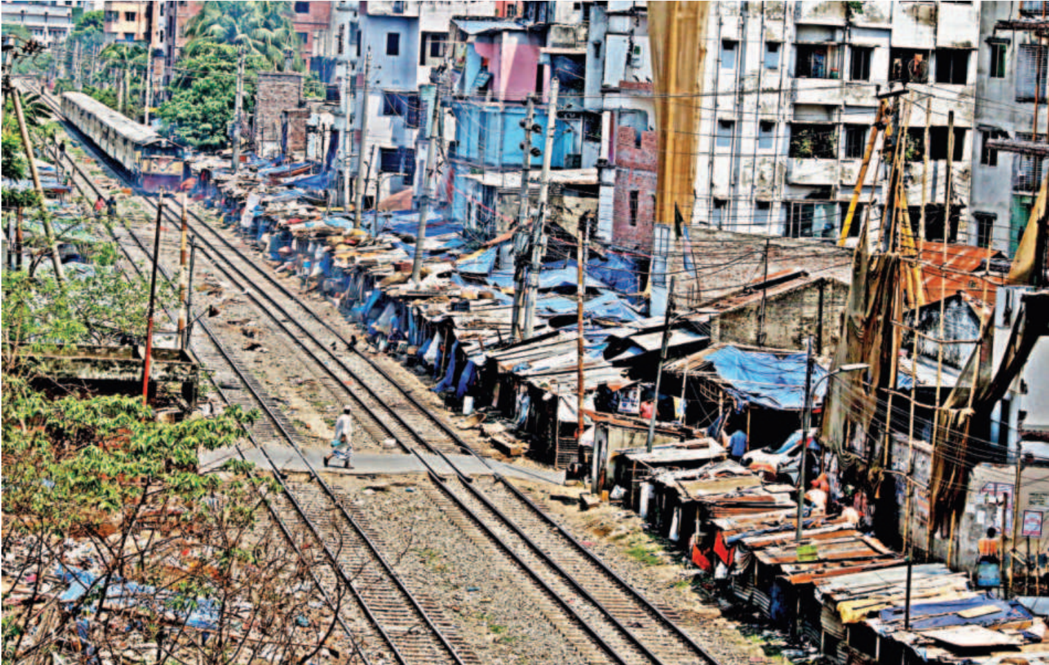
Traders have set up illegal makeshift shops along the rail lines in the capital's Malibagh bazar level crossing area. This exposes people, vehicles and trains to risks. The photo was taken recently.

Contacted yesterday, Rois denied the allegation.