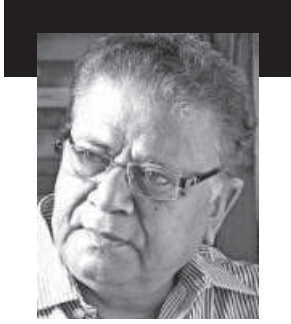
SAMARESH MAJUMDAR 1944-2023