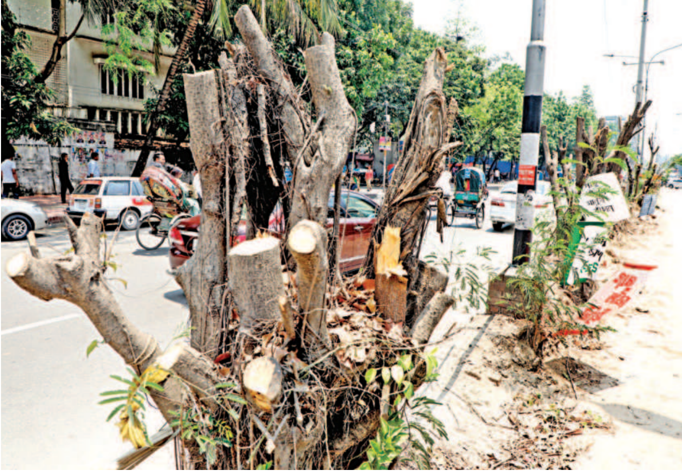
Delimbed trees on a road divider in front of Abahani Club in the capital's Dhanmondi. For around a week, the DSCC authorities have been felling trees or cutting off their limbs in areas across Dhaka South for "beautification purposes", despite the environmentalists repeatedly warning of adverse impacts. Earlier in January, the authorities had done the same but stopped after protests ensued. The photo was taken yesterday. Story on page 3.

Our Gazipur correspondent contributed to this report.